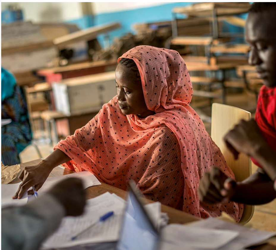
EC-ILO Mauritania project

The shared vision premised on a belief that economic and social progress should go hand in hand, and common support for 'Decent Work' and the achievement of the Sustainable Development Goals continue fostering many fruitful joint initiatives. This close relationship involves different modes of cooperation from knowledge-sharing and policy dialogue to development cooperation activities.