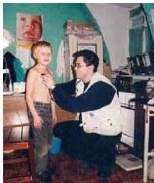
Examining a child in the Night drop-in centre

The practical component of the Action Programme resulted in establishing a night drop-in centre for street children engaged in the worst forms of child labour, like child prostitution and night work. The political impact of the Action Programme yielded intensification of political pursuit at a district level to effectively address child labour and its worst forms. The Implementing Agency – the Humanitarian Action as a local branch of Medecins du Monde – had already played a coordinating role in the district social policy. It had been fully integrated in the local social protective schemes and involved in planning, designing and fulfilment of social programmes in the City along with the Administration, Education Authorities, Police, local communities, and state medical institutions.