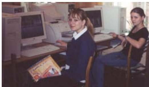
Girls at a computer literacy session

In October 2002 the Vice Government officially confirmed the city's commitment to institutionalise the ILO/IPEC Action Programme on working street girls by gradually incorporating its elements into the city programmes on street children. A respective planned budgeting was announced. As restructuring of the city budget had not been in place yet, IPEC started a four-month Programme with the implementing agency to secure sustainability of the gender practice developed under the above Action Programme. Ten working street girls were rehabilitated during it. The serious work carried out by the NGO was recognized by the St. Petersburg City Administration officials who visited the Action Programme several times: representatives of the Committee on Labour and Social Protection of Population, Committee on Contacts with the Local Self-Governance Structures, Department of the Federal Public Employment Services for St. Petersburg, Public Relations and Media Department of St. Petersburg.