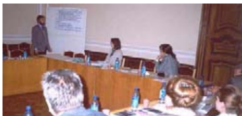
Presentation of the St. Petersburg Trade Union of Small and Medium Businesses

As a first step, two Trade Union representatives were trained by ILO/ACTRAV experts in a trainers' workshop in Moscow in April 2003, followed in June by a workshop for twenty members of a Working Group on Child Labour created at the Federation. The participants learnt how to mainstream the issue of child labour in all trade union activities. They also drew up the Terms of Reference for their Working Group endorsed by the Governing Body of the Federation