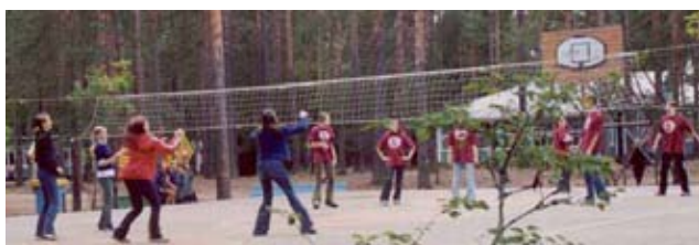
Ex-working children at the summer camp "Chaika"

In the framework of the above mentioned Programme 85, working street children from the Admiralteisky, Kirovsky and Nevsky districts were provided with free places at the summer camp "Chaika".