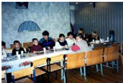
Meeting of a self-help group