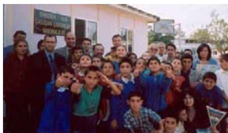
The St. Petersburg officials in the Adapazari ILO/IPEC Centre for street children

In the same month the IPEC National Manager was appointed a member of the City Commission on Minors and Protection of Their Rights 4 .