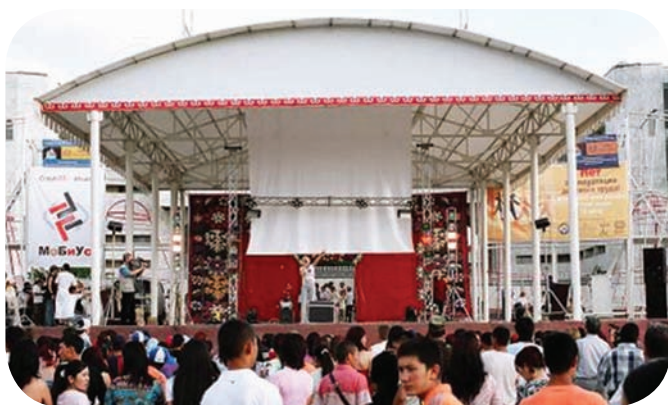
World Day Against Child Labour activities.

WDACL 2006 was dedicated to the launch of the second Global Child Labour Report, The end of child labour: Within reach . On 12 June, a concert “Stars of Kyrgyzstan against child labour” that lasted over three hours was organized in the main “Ala-Too” square of Bishkek with participation of Government representatives, and 13 local popular artists and bands. The representatives of the Secretariat of the National Council on Issues of Women, Family, Youth and Gender Development of the Kyrgyz Republic President’s Administration, Ministry of Labour and Social Development, Municipality of Bishkek, State Labour Inspection had speeches in the opening of the concert.