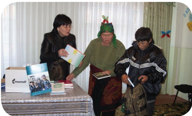
Provision of school supplies to a working child, Osh region, Kyrgyzstan 2009.