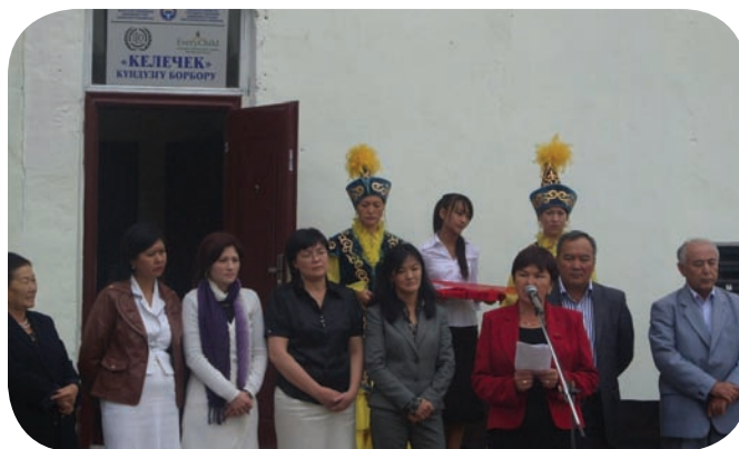
Official opening of Social Centre "Kelechek" in Karasuu city, 2009.

As a result of IPEC direct interventions during the period 2006-2010, 2,478 children and 241 families were provided with direct services (health, nutrition, school supplies, vocational training and skills, medical and legal counselling) and 425 children were prevented or withdrawn from the WFCL through provision of educational and training opportunities.