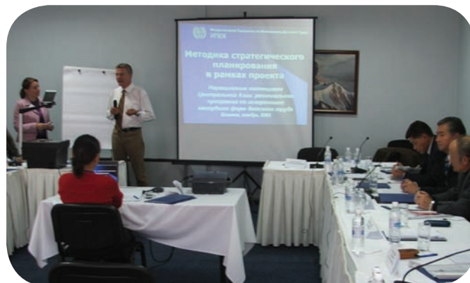
SPIF Workshop, November 2005.

The ILO's International Programme on the Elimination of Child Labour (IPEC) has been working in Kyrgyzstan since 2005 with the purpose to provide technical and financial assistance to eliminate the worst forms of child labour and to implement the ILO's child labour conventions: Minimum Age Convention (1973) No. 138 and Worst Forms of Child Labour Convention (1999) No. 182. IPEC activities in Kyrgyzstan were funded by the US Department of Labour and German Government under a common programming framework Programme on Action against Child labour and Trafficking in children in the Central Asian Region (PROACT CAR) that also includes Kazakhstan and Tajikistan. 3