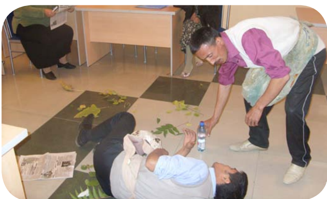
Training for teachers and educational officials, Osh region Kyrgyzstan, 2009.