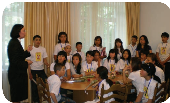
Meeting with the Minister of Labour.

“12 June. Coming soon...”. The “figures” were also placed in front of the main entrances of Regional State Administrations in Talas, Osh and Jalalabat Oblasts. Children have been sketched out and displayed from 27 May to 15 June. On 12 June, the inscription was changed into “12 June - The World Day Against Child Labour”. In addition, a campaign was covered by the media broadcasting a short video and radio jingles (20-30 seconds) on child labour.