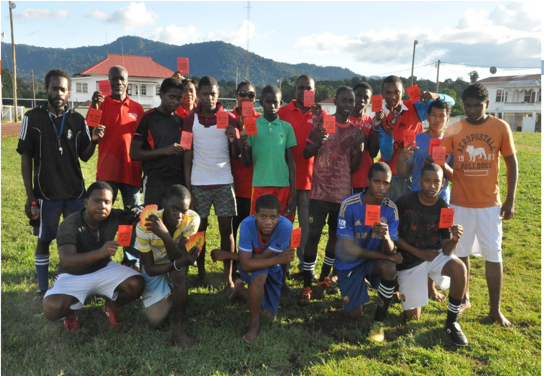
Young footballers hold the Red card to CL