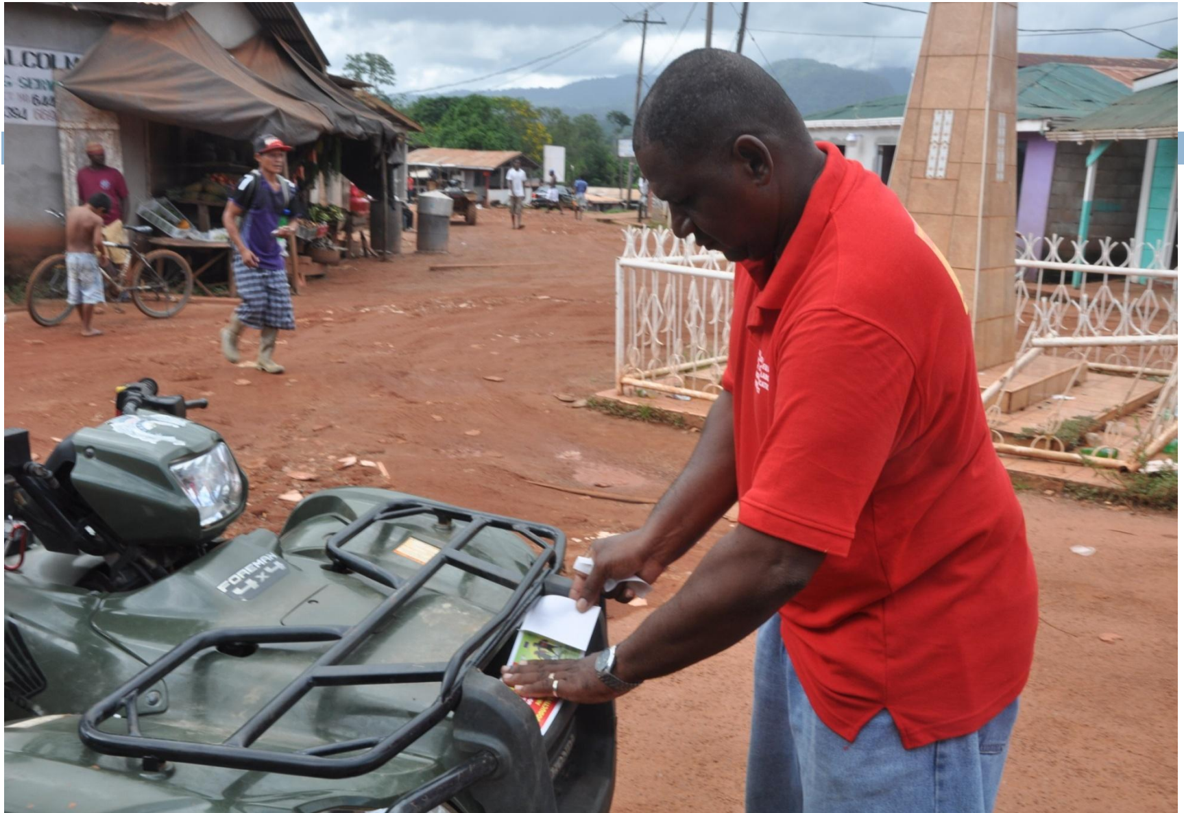
GTUC executive posts a bumper sticker in support of Education