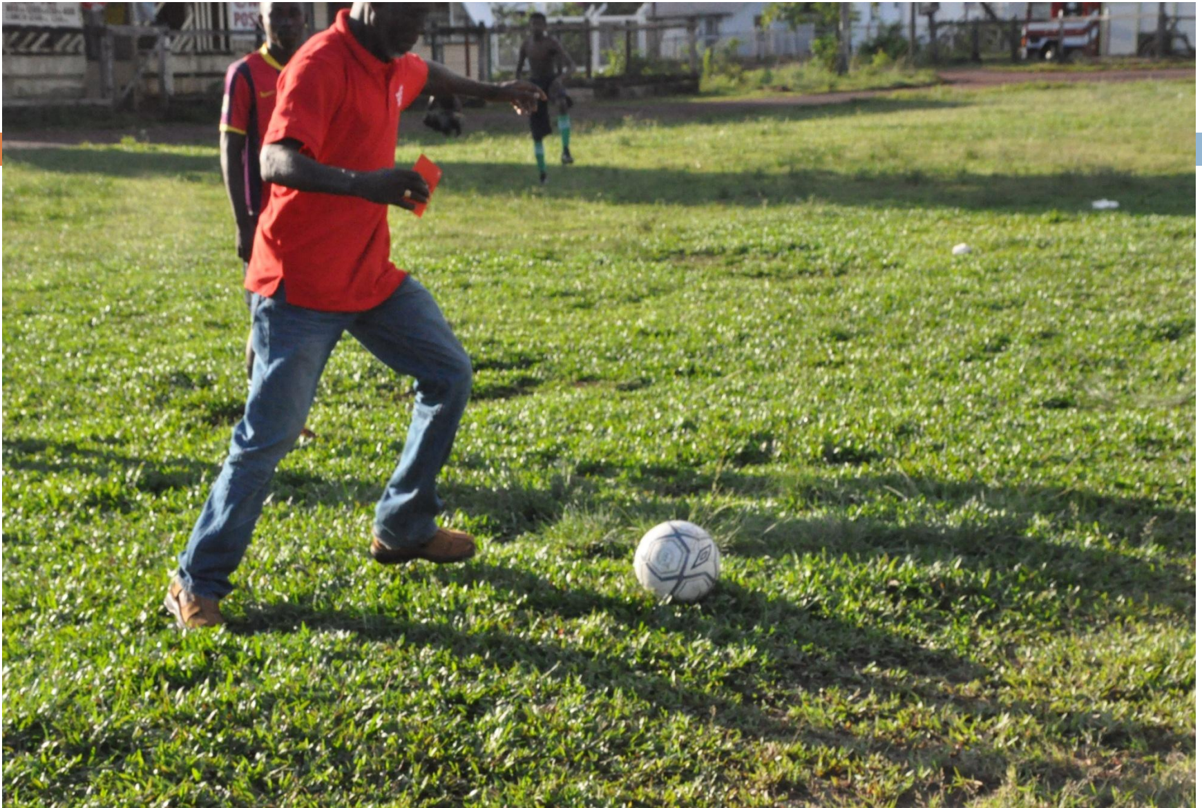
GTUC's President kicks off the ball to start sporting activities in Region 8