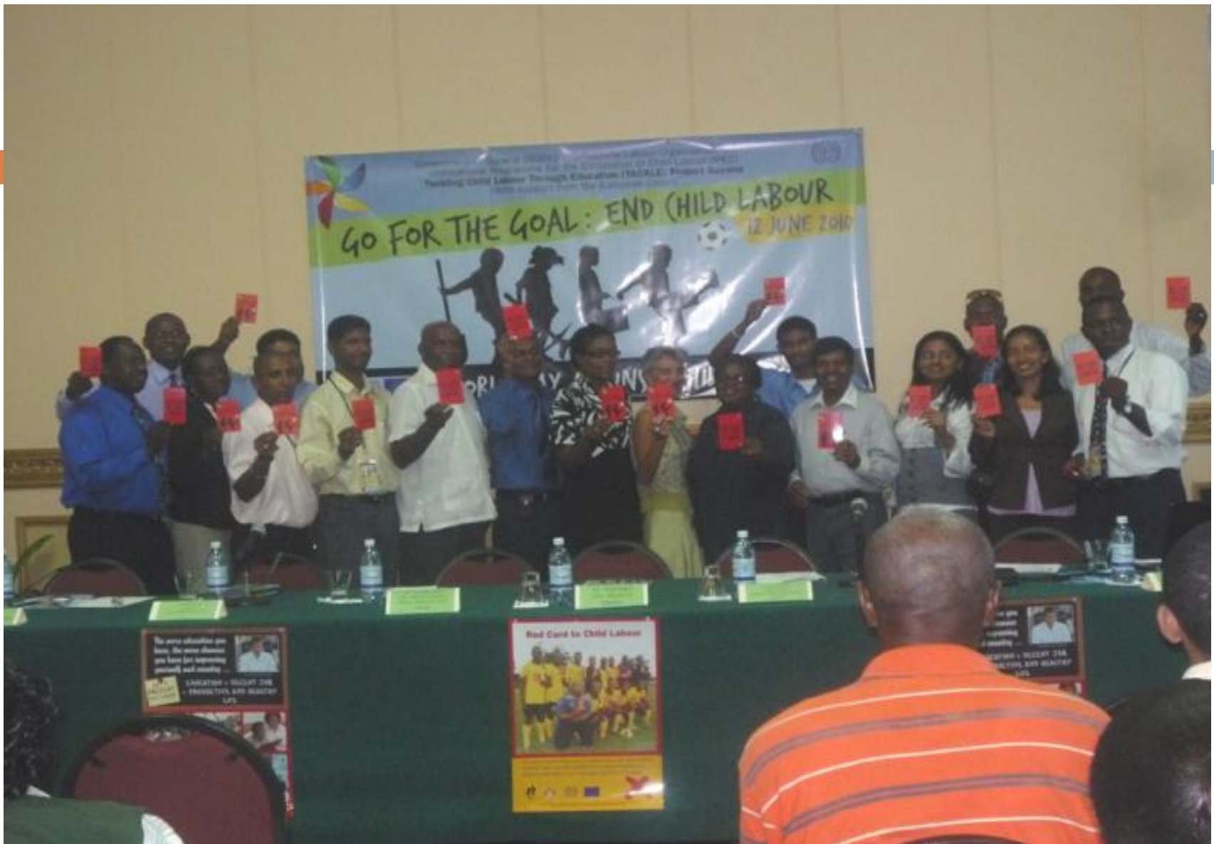
Members of the Tri-Partite body joined by media reps, old the Red Card to Child Labour