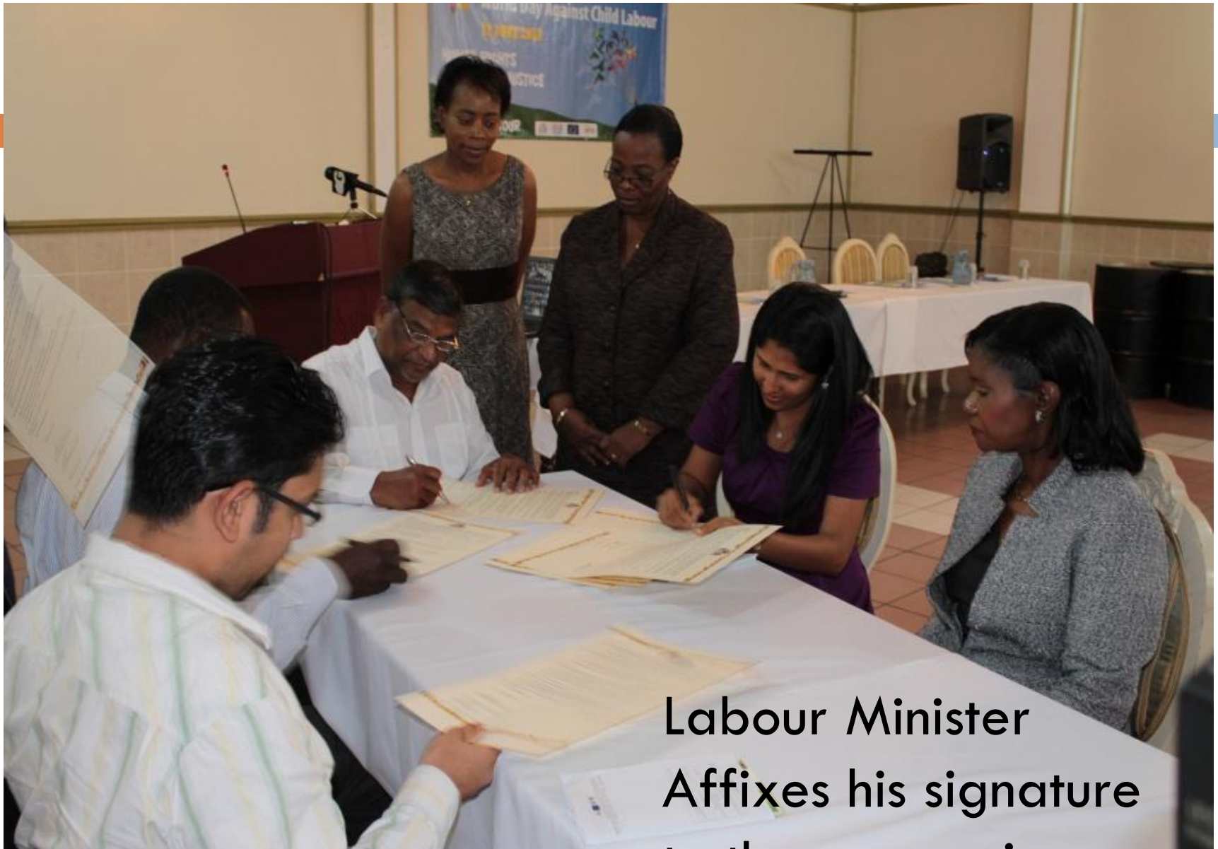
Labour Minister Affixes his signature to the communique