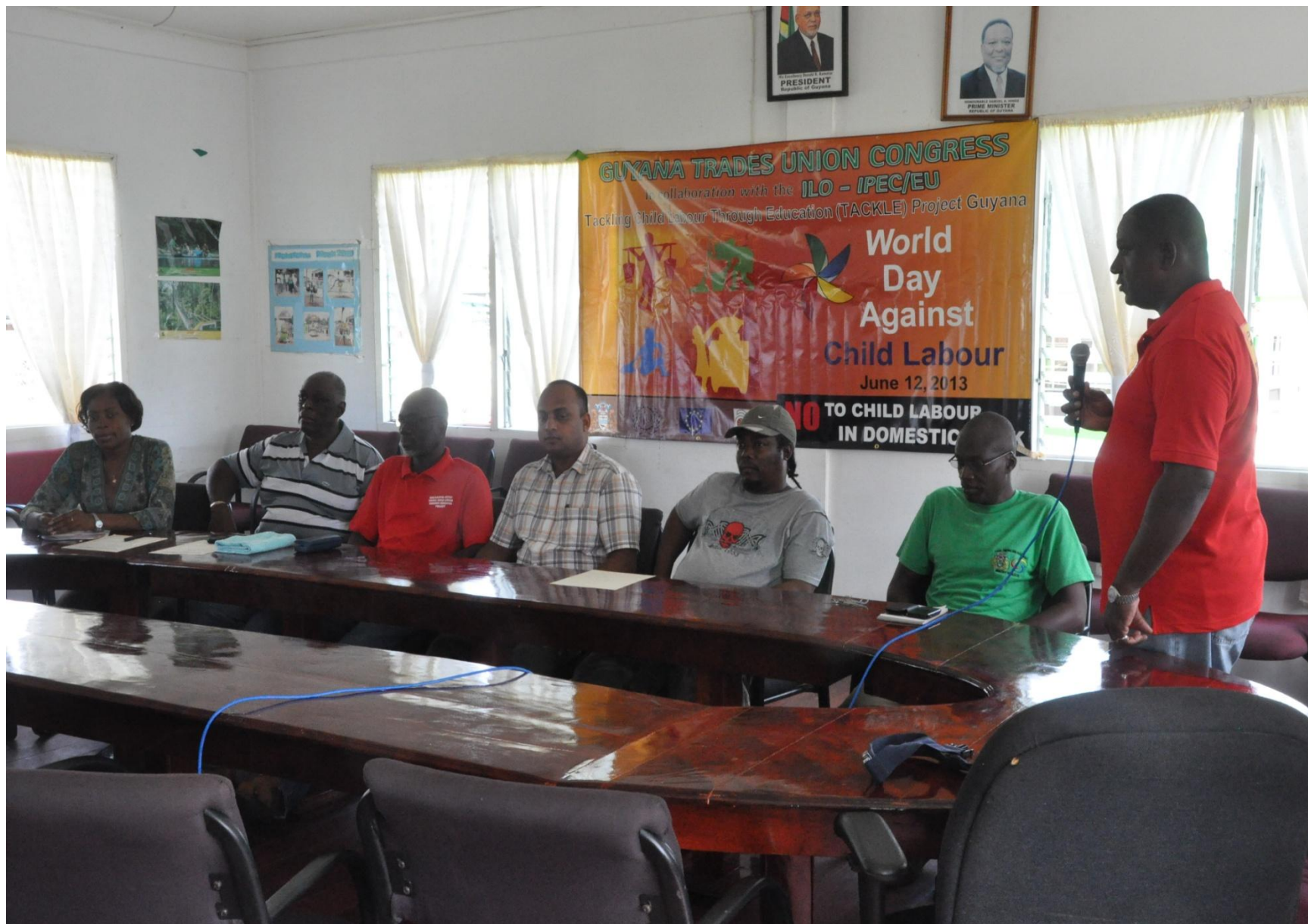
Communiqué Signing and media briefing, Region 9, 2013