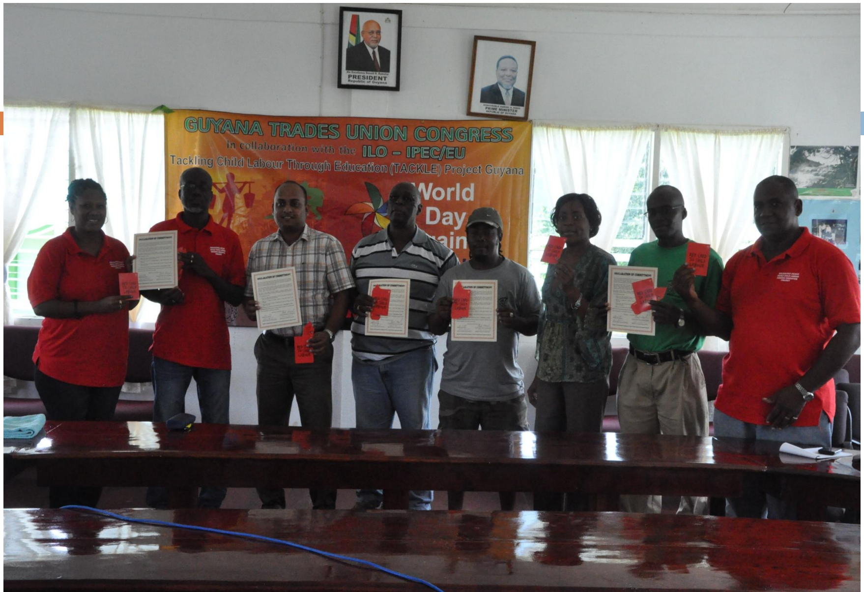
Representatives hold the Red Card to Child Labour and Display the signed Communiqué