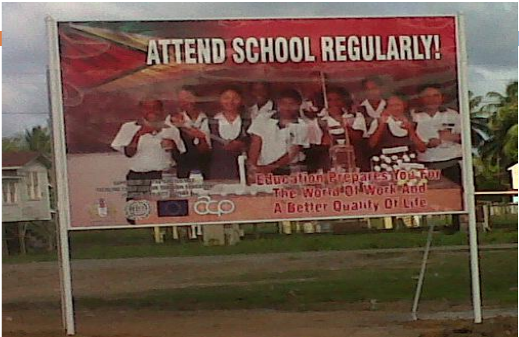
A collaboration with Tackle & The MOE....Large Bill board in Rural Guyana