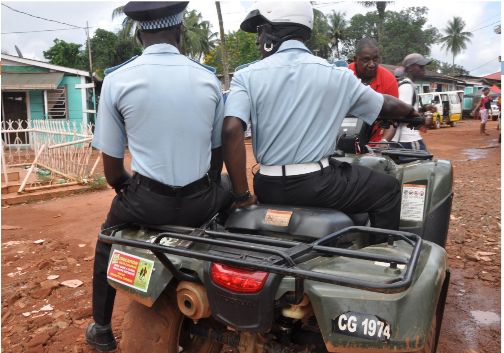
Guyana's Police force endorse the Fight against CL....Region 8