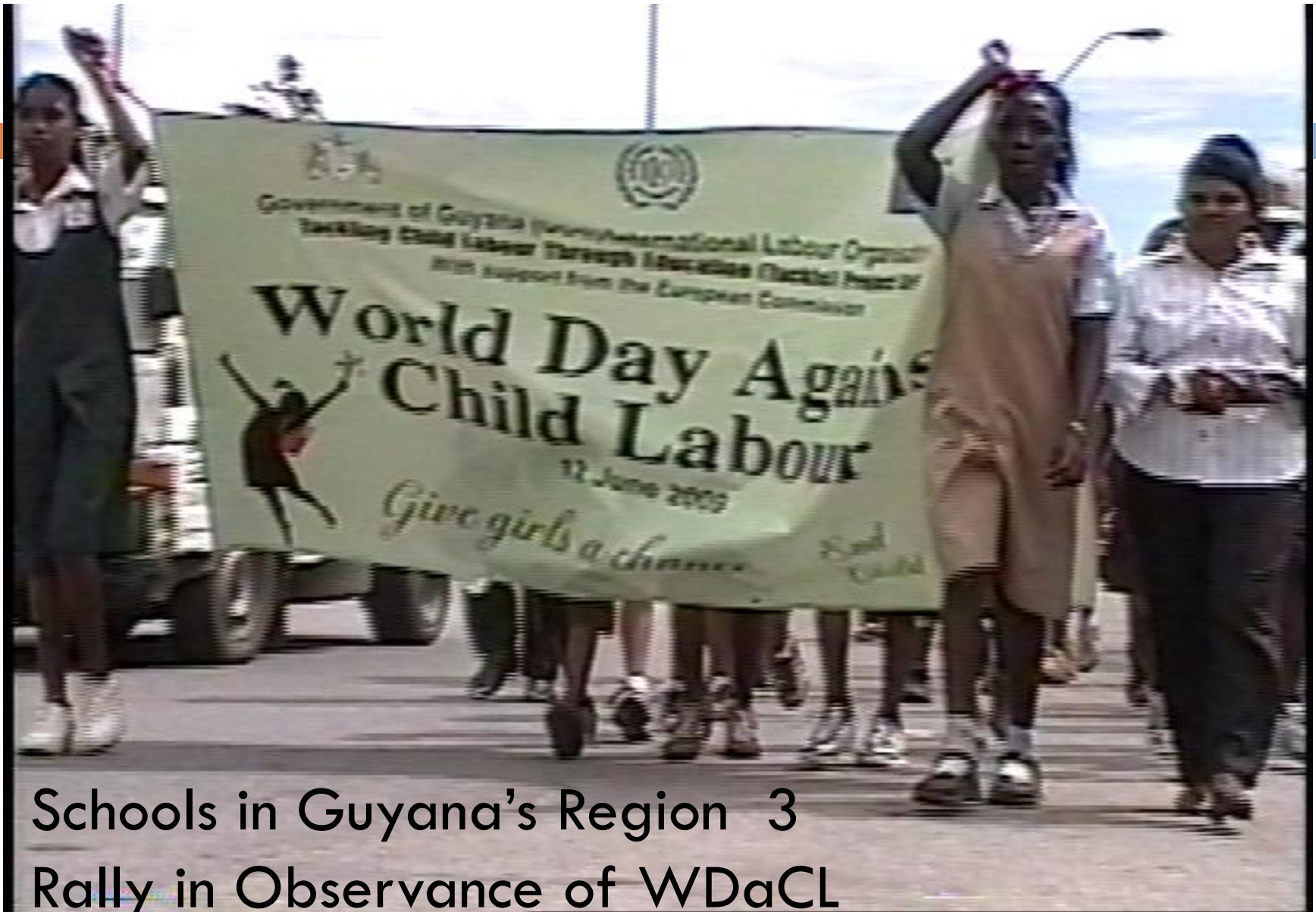
Schools in Guyana's Region 3 Rally in Observance of WDaCL