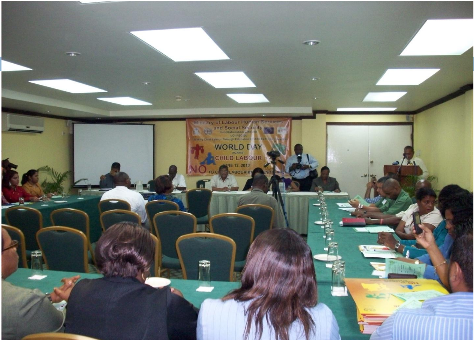
Child Labour Forum in observance of WDACL, 2013