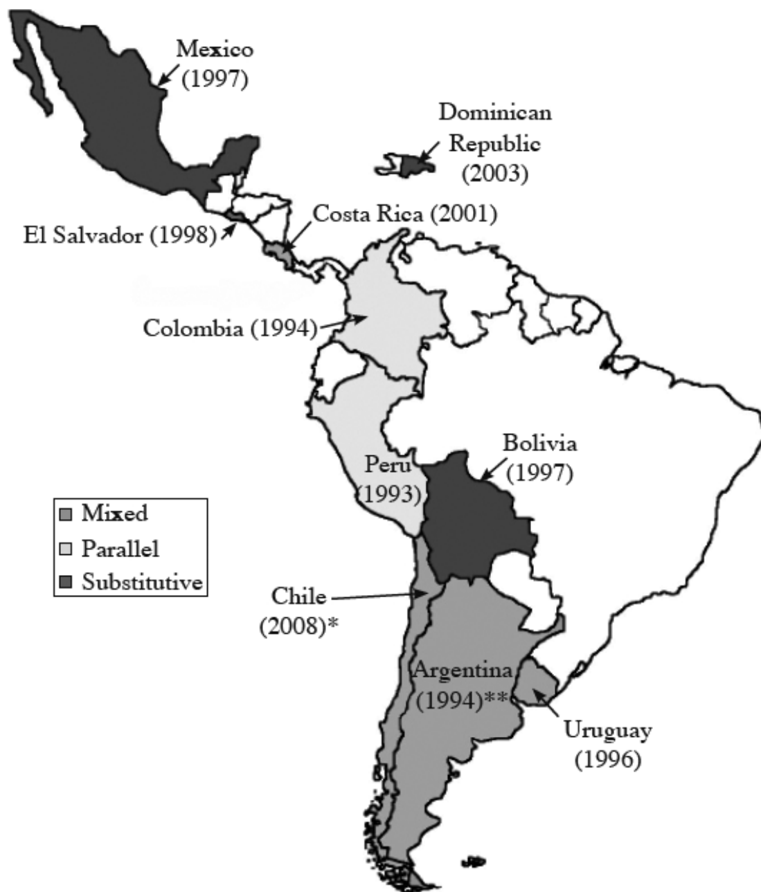
Figure 1. Structural reforms to old-age pension systems in Latin America

Note: * Substitutive in 1981; ** Re-nationalized in 2008.