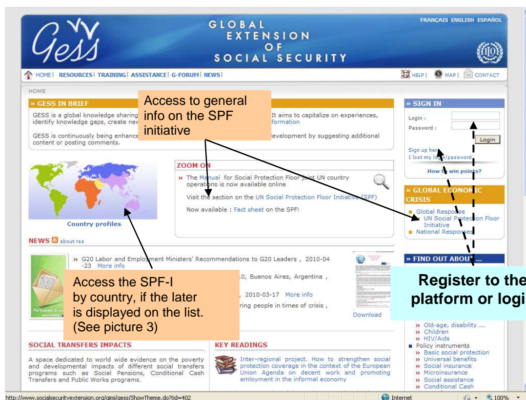
Picture 1: Accessing the SPF country pages – general information and by country