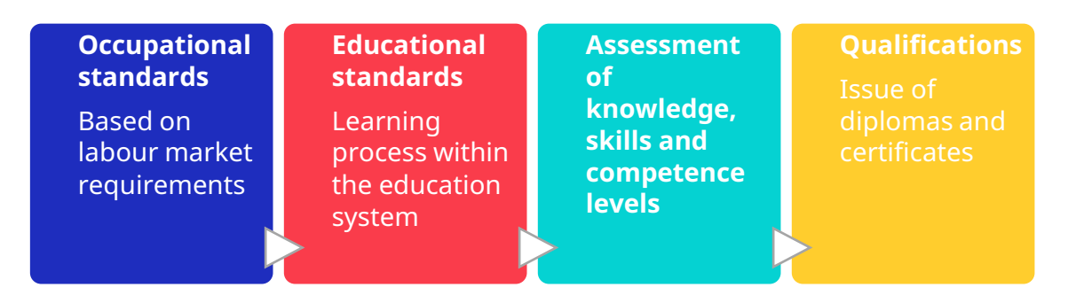
Figure 1.2: The qualification process