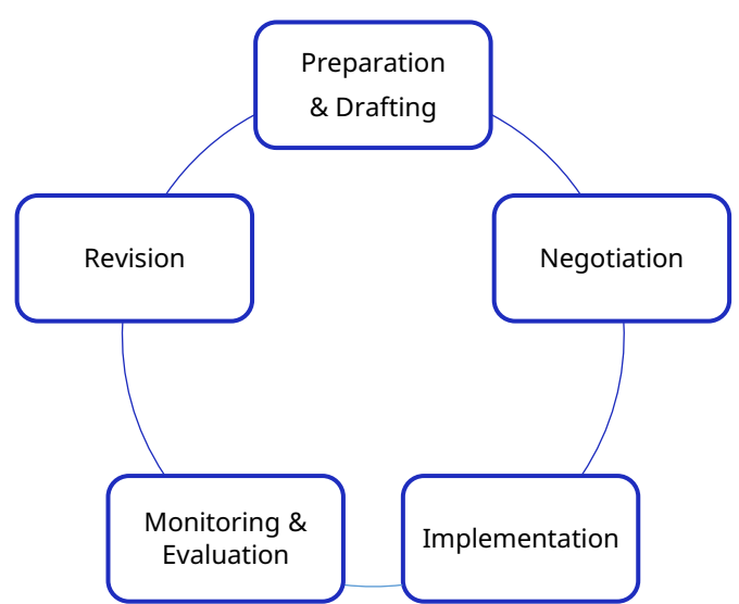
Figure 2.1. BLMA cycle