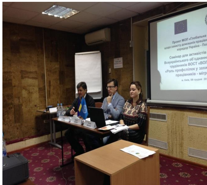
Presenting panel, VOST "VOLYA" workshop, 6 December 2014

friends and existing networks, changes in national legislation and ratification of the ILO Convention 189 on Domestic Work. An important outcome of the meeting was adoption of the resolution calling for ratification of C189 and need for its active lobby through the activities of the VOST. The resolution was decided to be submitted to the Parliament, the Cabinet of Ministers and President of Ukraine.