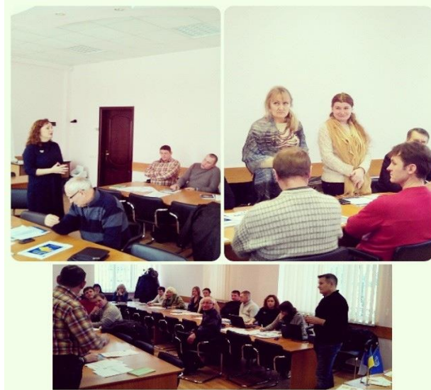
CFTUU workshop, 8-9 December 2014

Another workshop was conducted for leaders of the Confederation of Free Trade Unions of Ukraine (CFTUU) in Kyiv, Ukraine, 8-9 December 2014, bringing 25 affiliates from Kyiv, Kirovograd, Lviv, Kharkiv, Lugansk and Donetsk oblasts in order to agree on practical steps to reach out to migrants and domestic workers and effectively protect their labour rights. The main trends of labour migration towards Poland, challenges Ukrainian MDWs face, discriminatory practices and policy gaps were discussed based on the country profile research findings, conducted within the GAP-MDW in Ukraine and Poland.