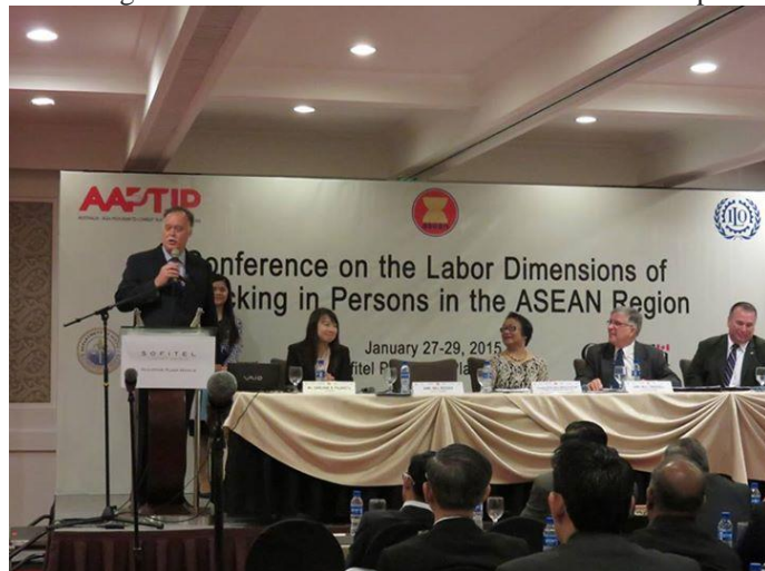
Opening of the Regional Conference on the Labour Dimensions of Trafficking in Persons in the ASEAN region, Manila, the Philippines, 27-29 January 2015

The regional conference on the Labour Dimensions of Trafficking in Persons in the ASEAN region was conducted on 27-29 January in Manila, the Philippines. The event brought together criminal justice and labour officers, inspectors and labour attachés from the ASEAN member states, among them representatives of SOMTC (Senior Officials Meeting on Transnational Crime), ACMW (ASEAN Committee on the Implementation of the ASEAN Declaration), ATUC (ASEAN Trade Union Council), ACE (ASEAN Confederation of Employers), TFAMW (Task Force on ASEAN Migrant Workers), AAPTIP (Australia-Asia Program to Combat Trafficking in Persons), as well as social partners and other stakeholders whose work relates to labour migration and trafficking in persons.