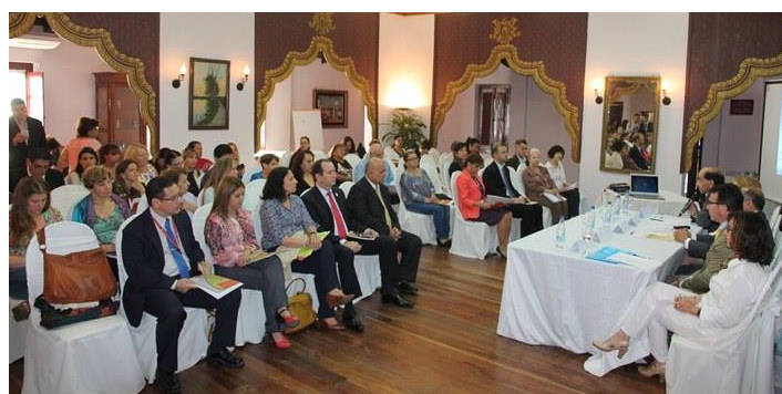
Paraguay-Argentina bi-national workshop, Asuncion, Paraguay, 8-9 April 2015

A bi-national workshop "Paraguay-Argentina corridor: Strategies for Promoting the Rights of Migrant Domestic Workers" was held in Asuncion, Paraguay, on 8-9 April 2015, and was organized under the auspices of the EU funded Global Action Programme on Migrant Domestic Workers and Their Families* (GAP-MDW) with an aim to discuss and exchange experiences in promoting and defending the rights of migrant domestic workers. The workshop was attended by 64 participants from both countries, among them representatives of government, employers' and workers' organizations, domestic workers organizations, academics and civil society.