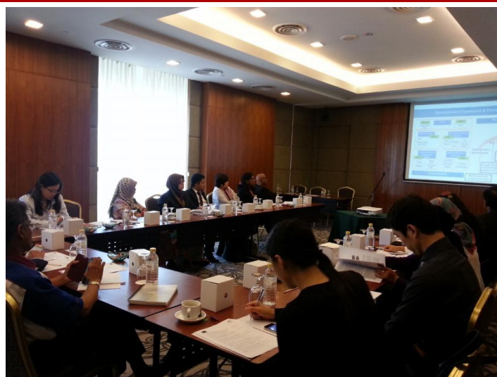
Research Results Validation Workshop on Employers of Domestic Workers, Kuala Lumpur, Malaysia, 9 December 2014

Representatives of Ministry of Human Resources (Labour Policy Division, Foreign Worker Division), Human Rights Commission of Malaysia (SUHAKAM), Malaysian Trade Union Congress, Malaysian Association of Foreign Maid Agencies (PAPA), Malaysian National Association of Employment Agencies (PIKAP), Malaysian Employers Federation (MEF), Malaysian Maid Employers Association (MAMA) provided their comments and feedback on the conducted study.