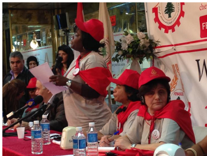
Members of the Founding Committee, Founding Congress of Domestic Workers Union in Lebanon, January 2015

FENASOL's Domestic Workers' Union is the first union in Lebanon and in the region that represents the interests of migrant domestic workers. This initiative sets an important precedence in a region where migrant domestic workers are subject to the Kafala (sponsorship) system, which restricts their freedoms and makes it difficult for them to leave abusive employers. Workers testify about their limited fundamental rights and freedoms, as well as the challenges they face as migrant workers. The Congress launched the Union and voted on the unions' by-laws.