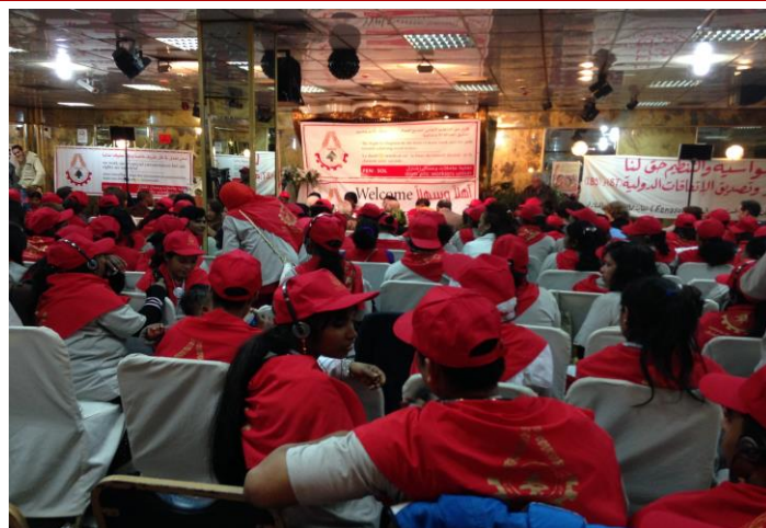
The Founding Congress of Domestic Workers Union in Lebanon, January 2015

The Founding Congress of Domestic Workers Union in Lebanon took place on 25 January 2015 in Beirut with participation of 300 domestic and migrant domestic workers. The union is affiliated to the National Federation of Workers' and Employees' Unions in Lebanon (FENASOL).