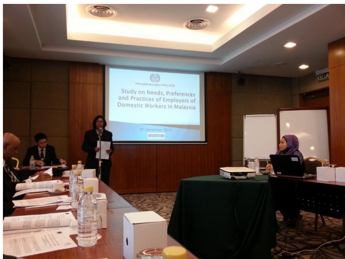
Research Results Validation Workshop on Employers of Domestic Workers, Kuala Lumpur, Malaysia, 9 December 2014

The main research findings show that the majority of employers recruited domestic workers through agency and most of them are familiar with the rights and obligations as employer whilst being unaware of the contents of the MoU between Indonesian and Malaysian governments on domestic workers.