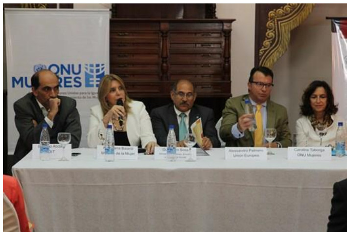
Panel of speakers, Paraguay-Argentina bi-national workshop, Asuncion, Paraguay, 8-9 April 2015

the framework of the GAP-MDW. In the context of sharing experiences and good practices, the Vocational Training Modules for domestic workers within the training programme led by the Ministry of Labour of Argentina were presented and a possibility to create a compatible training programme in Paraguay was discussed. Presentation on experiences of social dialogue in domestic work sector on example of Uruguay further contributed to the discussion.