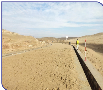
Figure 1: Existing Subgrade of Loose fine sand on the Shortepa District Road.