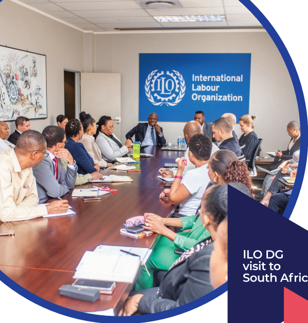
ILO DG visit to South Africa