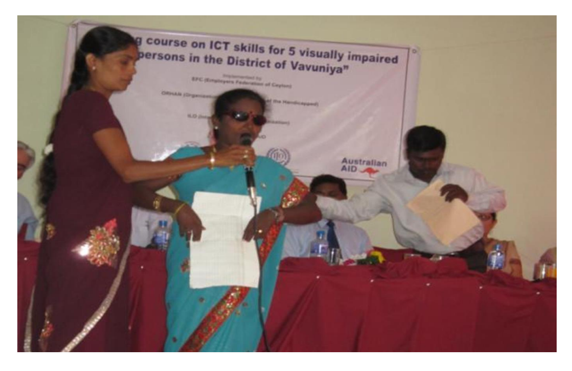
Figure 6: Large number of war disable people on warn-torn areas of Sri Lanka

People with disabilities account for an estimated 15 per cent of the world's population and between 785 and 975 million of them are within the working age (15 years old or older). Most of these people live in developing countries where the informal economy employs a substantial proportion of the labour force. Due to stigma, inaccessible environments and other societal barriers, people with disabilities labour force participation rates however, are much lower than those of persons without disabilities. A huge majority of persons with disabilities worldwide are living in rural areas, thus the challenges to fulfil their right to decent work is further hindered.