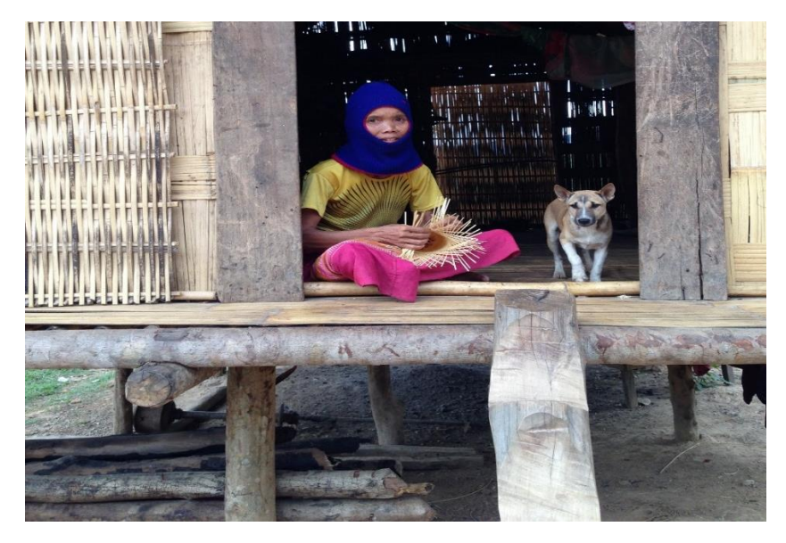
Figure 5: Sekong Province the poorest and most diverse of Lao PDR has 14 different ethnic groups

ITPs are often characterized by political, economic and social marginalization, which lead to their exclusion from national decision making processes - even in decisions that concern them directly, for instance with regard to the management of natural resources. Victims of the increasing global demand for energy and intense activities of extractive industries, see their traditional livelihoods most threatened, limiting their development capacities and opportunities.