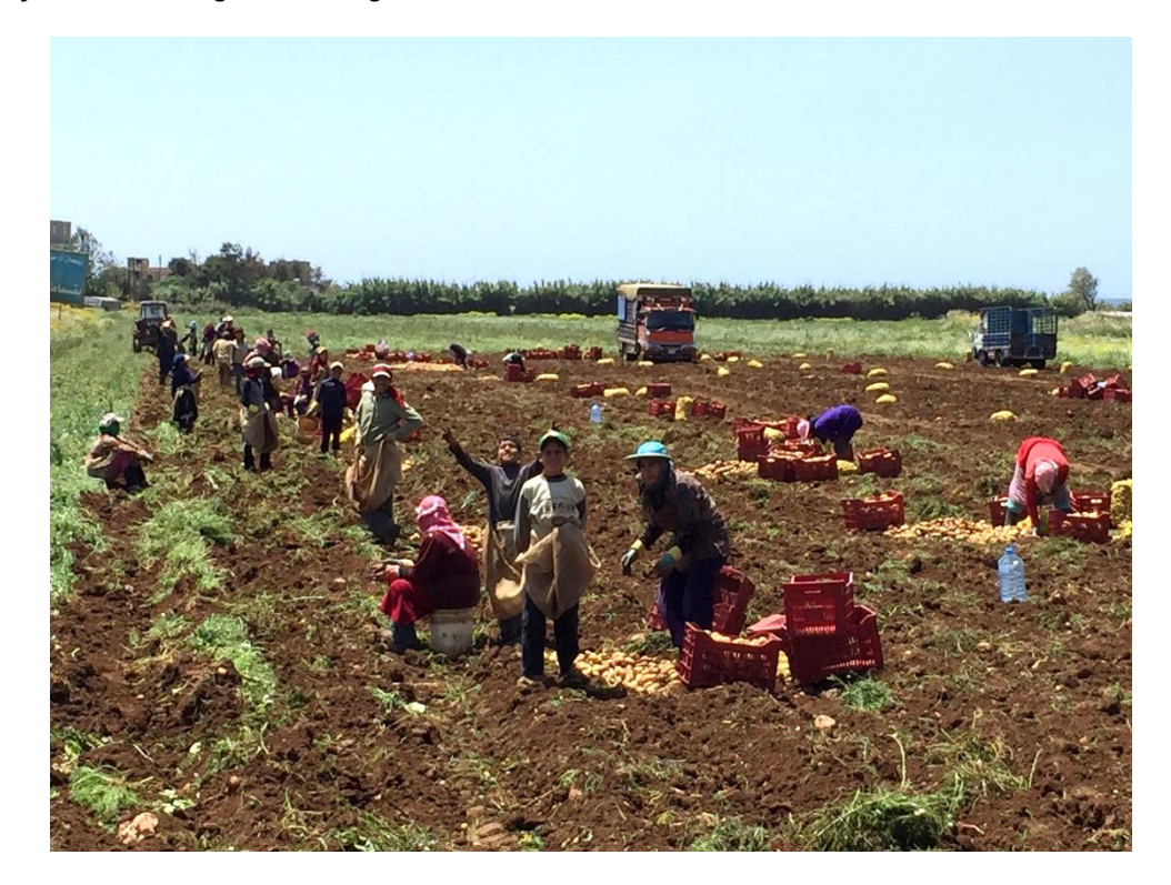
Figure 4: Syrian child refugees working in Northern Lebanon

b. Youth and youth vulnerabilities on the labour market: the vulnerabilities of rural children, especially rural child labourers, have presence in the age group between 15-24 or 15-29 years old in some definitions. The limited access to education in rural areas means that potential labour productivity remains low. Moreover, limited availability of stable and paid jobs, mean that rural young women and men work primarily in own-account work or in family establishments, as unpaid family workers). Vulnerable employment remains the dominant status of employment among rural youth both in agriculture and in the non-agricultural sector (with exceptions),<sup>54</sup> and this situation can lead to a feeling of demotivation. There is limited access to training on means to scale up small scale enterprises. Agriculture remains a vulnerable venture, with no social protection, insurance for crop failure or finances to promote investment. Youth are sources of positive change and have a lot of potential but require a sustained investment as a target group in order to ensure they are given the proper tools to meet their productive potential.