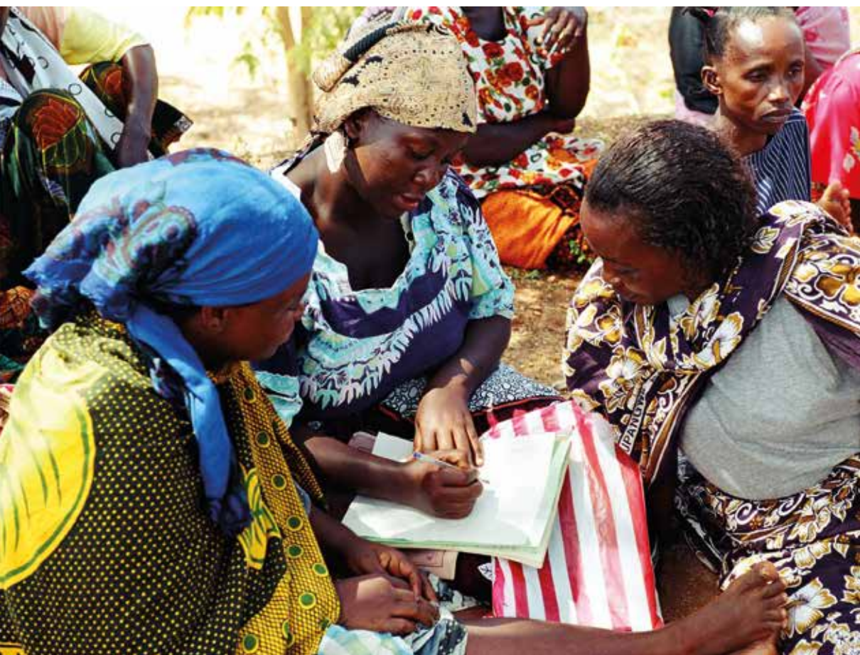
Members of an Eastern African cooperative sharing recipes