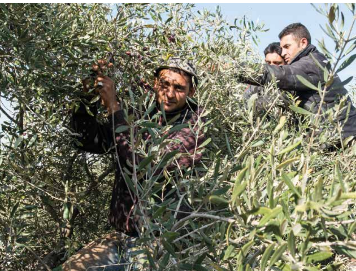
Members of Syrian refugee-hosting communities trimming olive trees in Jordan.