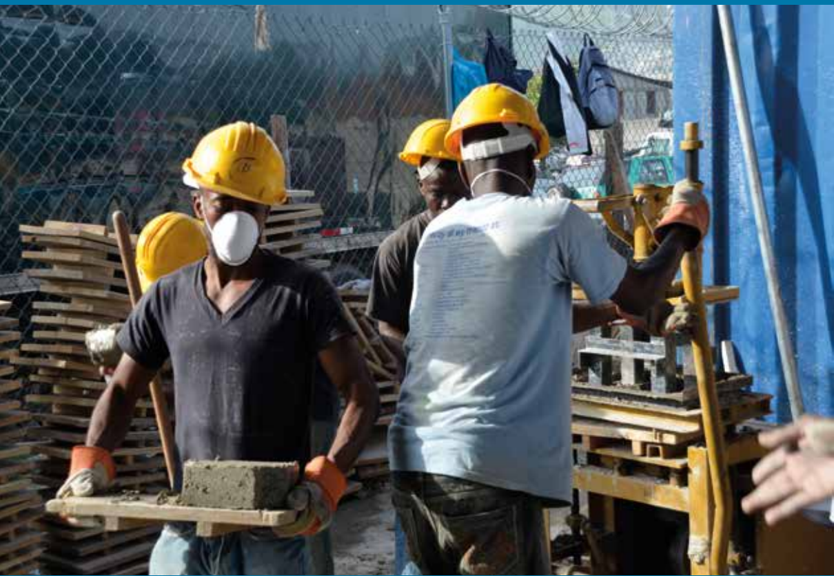
Construction workers help rebuild post-earthquake Haiti.

Employment Policy Department International Labour Office