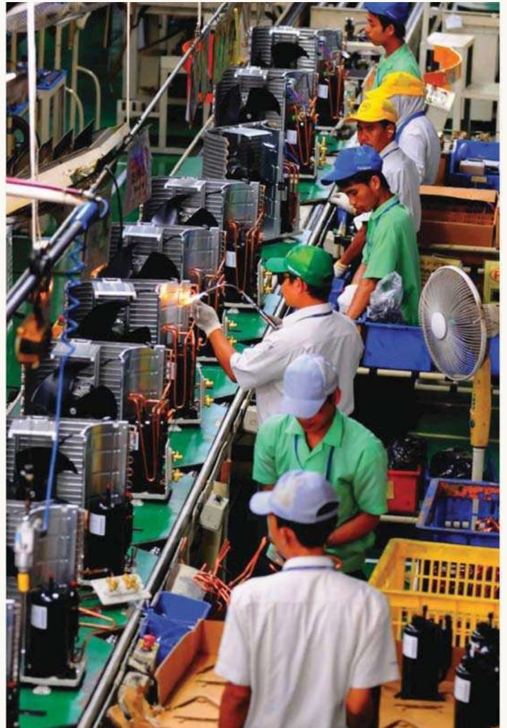
One of the electronic factories in Indonesia

“ Strengthening the labour inspectorate to be modern and effective and ensuring its coordination between national and provincial level are our priorities. This will result in promotion of law compliance and enforcement. ”