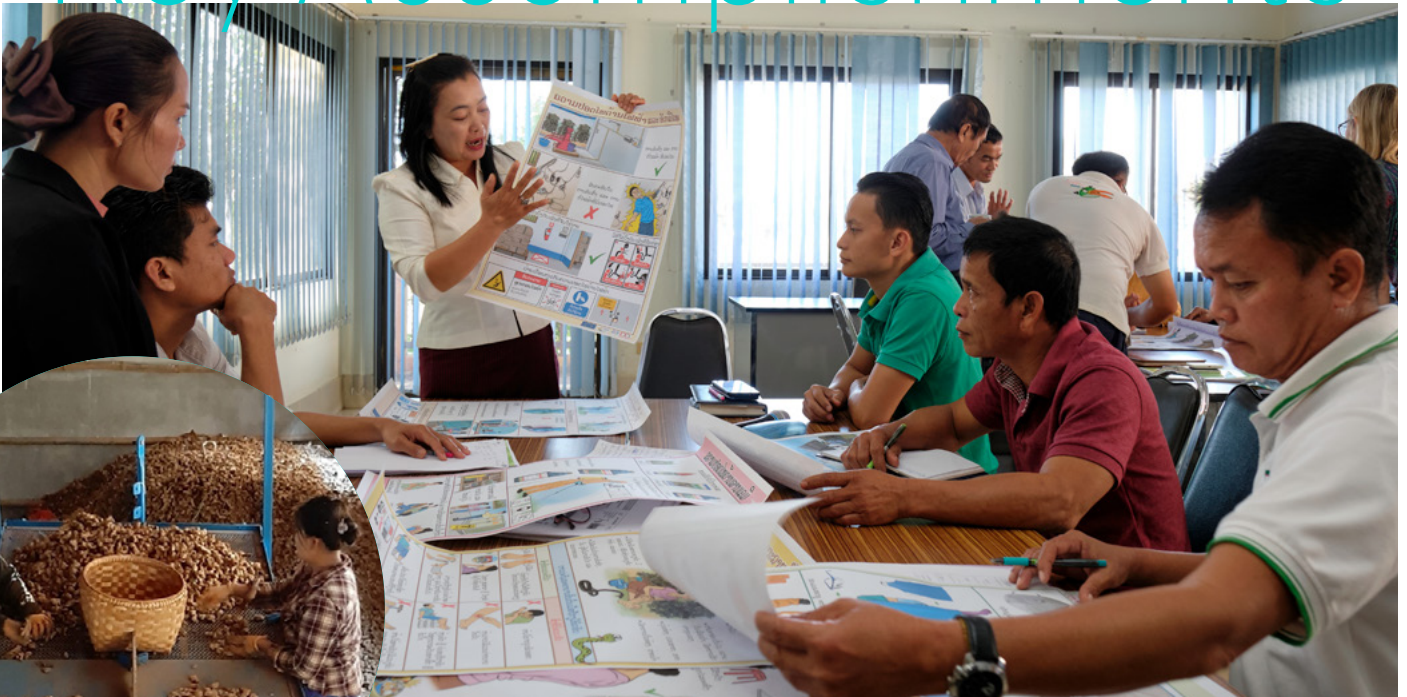
Above: Training material validation with project partners in Lao PDR, Nov. 2019