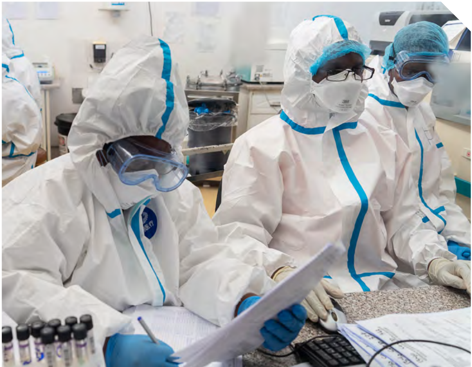
Health workers testing for COVID-19 at the Mpilo Central Hospital in Bulawayo, Zimbabwe, in April 2020.

A crisis does not just suspend the world in time so that it can snap out of it one fine day. It will be a different world, and history has repeatedly shown that it is shaped by the remedies that are administered when constraining catastrophes and carrying out reconstruction. This dynamic has produced the active labour market and social policies that define our societies today. If the world is to remain true to the aim of social justice, it will need the instrumentarium of international labour standards developed through the ILO.