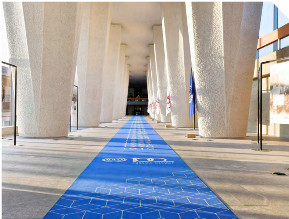
COVID-19 forced the United Nations system to close down and rely on distance work. In the picture, the deserted colonnade of the International Labour Office in Geneva.

We may have finally got a taste of the environmental catastrophe that we have been dreading for some time now. Today’s crisis has shown itself to be different from the prospect of Venice, Jakarta and New York being engulfed by rising sea levels. It is not destruction by earthquakes, tsunamis or cyclones. It has an eerie resemblance to the danger that a “neutron bomb,” instead of physical nuclear mass destruction, could