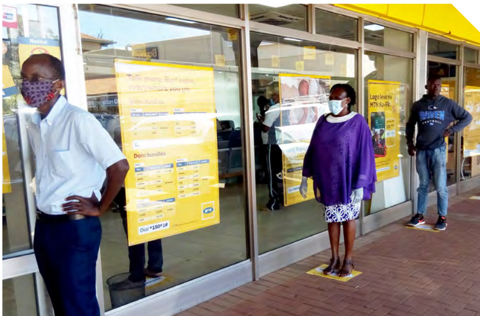
Standing in queue is an unmistakable sign of crisis. Observing social distancing while queuing to shop in Kampala, Uganda, in May 2020.