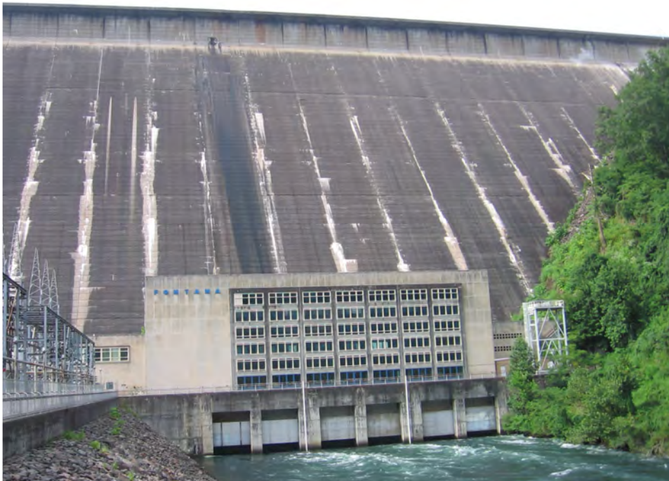
The Tennessee Valley Authority, created by the New Deal in 1933, provided both work and economic opportunities in a State with development needs. Dams for hydroenergy are typical infrastructure projects. In the picture, the Fontana Dam in North Carolina.