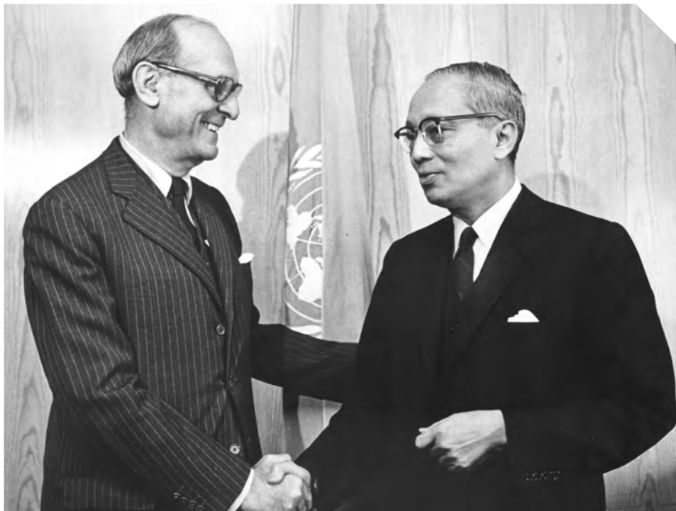
David Morse (left) and the Secretary-General of the United Nations, U Thant, at the 50th anniversary of the ILO in 1969 where the World Employment Programme of the ILO was launched.

Once decolonization began, the reorganization of the multilateral system centered on the United Nations. The UN succeeded where the League of Nations had failed. It had also started with crisis management; its first institution in 1943 was the United Nations Relief and Reconstruction Agency. In two decades, UN assistance was to become a regular feature of supporting the economic and social building up of a new