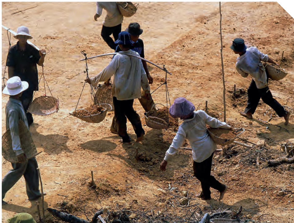
The restoration of the Angkor Wat temple site in Siem Riep, Cambodia, and the building of the road system around it was done by an ILO labour-based programme in the 1990s.

Later, the ILO pursued anti-crisis activities through its Jobs for Peace and Resilience flagship programme. It developed relief measures in the event of armed conflict, displaced persons, refugees, natural disasters and transition countries. It uses employment-intensive investments to overcome acute crises; technological, vocational and entrepreneurial skills; employment services; and private sector and local economic and business development. The activities rely on institution building, respect for fundamental principles and rights at work, and social dialogue.