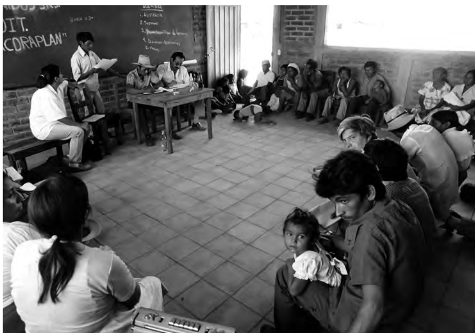
A meeting with the beneficiaries of an ILO-assisted project for the integration of displaced persons in El Salvador in 1989.

In his report to the Conference in 1966, David Morse explored the need for industrialization in developing countries, suggesting that a new class of entrepreneurs be developed. He chose his words carefully, avoiding references to the private sector although the implication was that this hardly could be done by the public sector alone. Like his predecessors in the interwar period, Morse emphasized planning and industrial policies which presumed state guidance and consultations with the social partners.