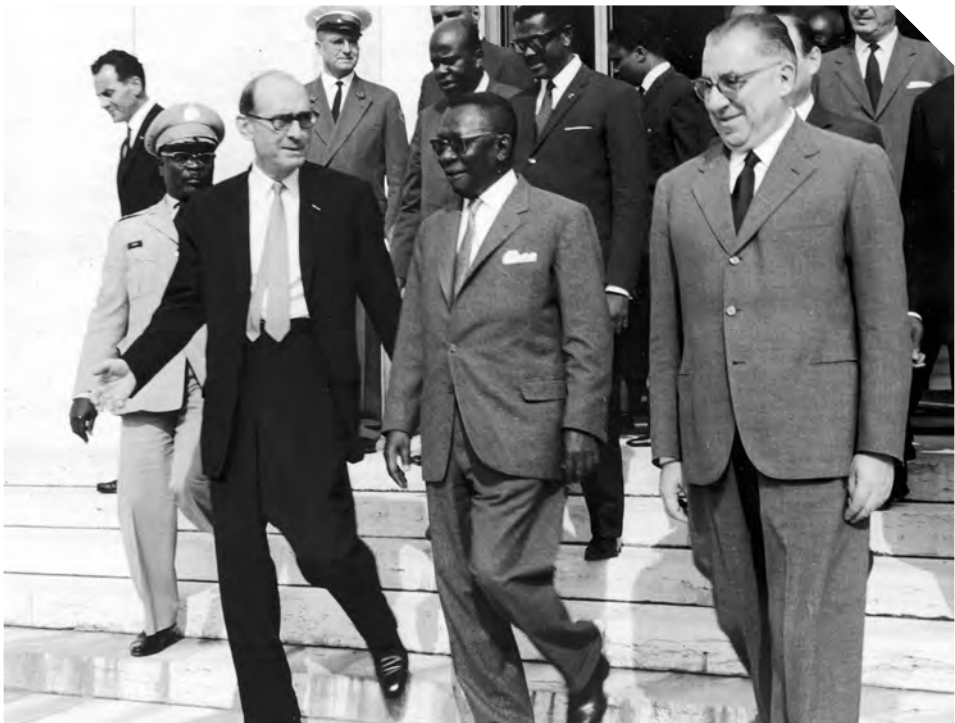
David Morse receiving President William Tubman of Liberia, who addressed the Conference in 1964.

In industrialized market economies, workers' growing prosperity contributed to welfare and production. Standards for income support, social security and health and safety became a driver of prosperity. The mistakes of the Treaty of Versailles which had punished Germany were avoided. Private employers did not resist the improvement of living standards, as the economy was not a zero-sum game.