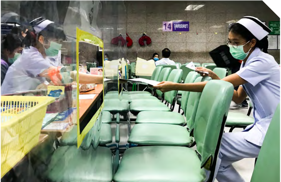
In 2020, health-care personnel had to observe strict security measures (here in a Bangkok hospital) while caring for a rapid increase in COVID-19 cases. Still, hundreds of them were infected and many died.