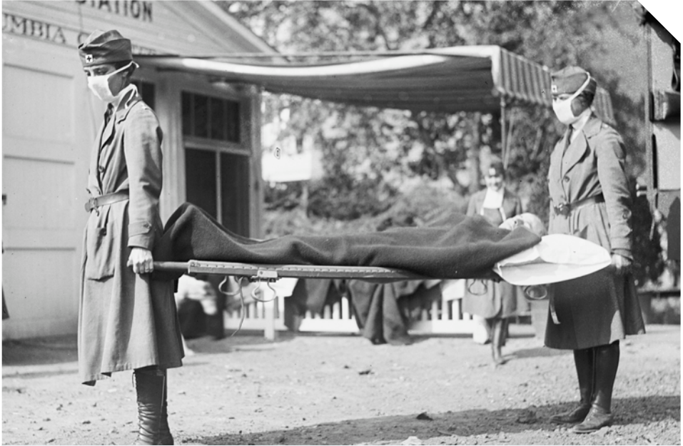
Over a hundred years of front-line work. Nurses were mobilized in 1918 to transport patients of the Spanish flu in Washington D.C.