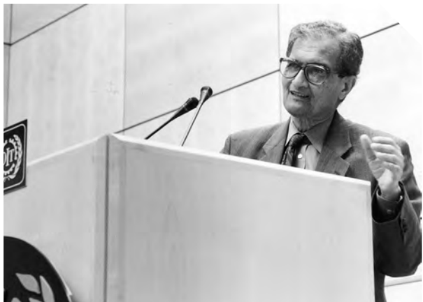
Amartya Sen, laureate of the Nobel Economics Prize, called Decent Work a developmental paradigm in his speech to the 1999 International Labour Conference.

As of the beginning of the twenty-first century, Decent Work became the shorthand version of all that the ILO stood for. Conference reports pinpointed decent work deficits and promoted the notion of working out of poverty. The Governing Body adopted a Global Employment Agenda in 2003, with the aim of bringing decent work into the core of economic and social policies.