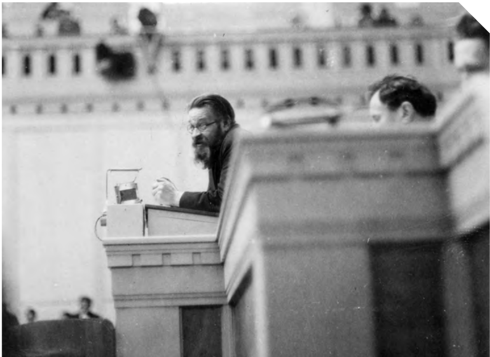
Director Albert Thomas addressed the International Labour Conference for the last time in 1932. He continued to call for better international cooperation on economic and social policy to improve employment and working conditions.

Thomas was strongly in favour of extending public works beyond nation states. Together with the League of Nations, infrastructure programmes were contemplated by a "Commission of Enquiry for European Union." Workers considered such measures too palliative; for employers, they seemed utopian. Thomas maintained his belief in European public works although it mainly resulted in arranging