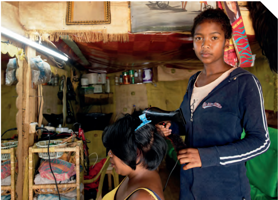
Hairdressing is emblematic of micro-scale activities in both the informal and the formal sector. Picture from Antsirabe, Madagascar, 2017.

According to 2019 figures, 70 per cent of employment is either self-employment or provided by micro-, small and medium size enterprises. The lower the country’s income level, the higher this figure climbs. In low income countries, 80 per cent of the labour force is at risk in the COVID-19 crisis. In the lowest income countries, very few enterprises have more than 50 employees. When these jobs are lost, incomes and health and old-age insurance coverage disappear as well.