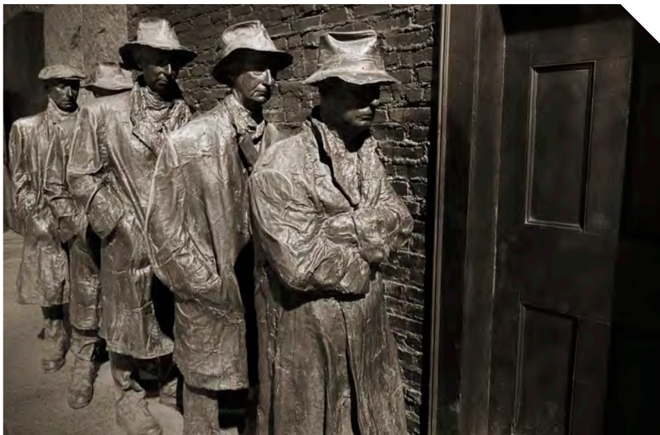
Statues of the Franklin D. Roosevelt Memorial in Washington DC depict a bread queue of the Great Depression.