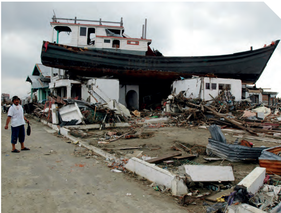
The powerful tsunami that hit Banda Aceh, Indonesia, in December 2004 carried a boat to the distance of 3 kilometres from the ocean. The ILO was involved in reconstruction of the local economy.

Transforming emergency relief into more institutionalized and sustained action was accompanied by consultations with employers' and workers' representatives. Situations where child or forced labour could be used had to be avoided. When in May 2009 the cyclone Nargis devastated much of the Irrawaddy Delta, despite decisions preventing technical cooperation with Myanmar, the ILO implemented a jobs and livelihoods project in the delta area. This was proposed by the Workers' Group to prevent the use of forced labour, which was the reason for the restrictions.