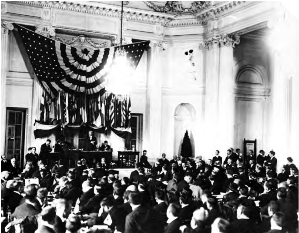
The first International Labour Conference in Washington DC in 1919 adopted Conventions and Recommendations on employment and unemployment, hours of work, minimum age, maternity protection and hazardous substances such as anthrax and white lead.

Recommendation No. 1 included unemployment insurance systems with public expense or subventions to associations managing such systems. The ILO was to coordinate the operations of various national systems.