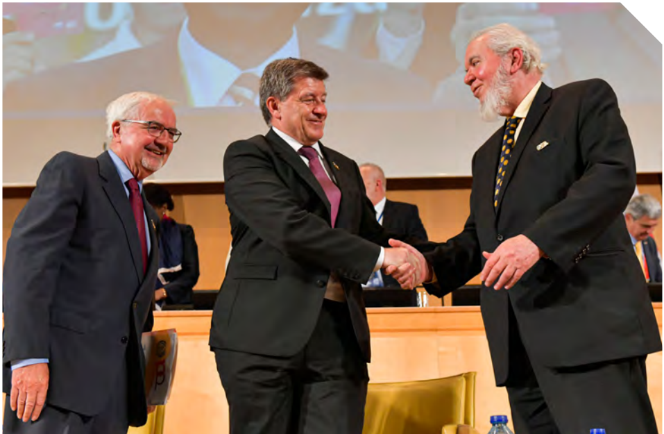
ILO Director-Generals of the period after the Cold War. Michel Hansenne (left), Guy Ryder and Juan Somavia, at the Centenary Conference June 2019.

Transition has since been referred to as one reason for the ILOs’ anti-crisis activities. In a number of former constituent parts of the Soviet Union and Yugoslavia, armed conflicts occurred. ILO standards could not do much about them, but in the middle