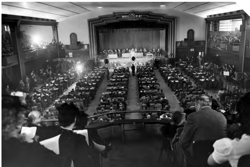
Plenary Session of the Conference in May 1944 in Mitten Hall, Philadelphia.

The Philadelphia Conference adopted Recommendations on employment services and public works (national planning). It also initiated the work which led to the Labour Clauses (Public Contracts) Convention, 1949 (No. 94). A resolution summarized the pre-war standards for organizing employment. The standards concerned fee-charging employment agencies (1933), unemployment provision (1934), minimum age in industry (1937) and public works (1937). The resolution encouraged their ratification and implementation, and issued Recommendations on these topics and on the unemployment of young persons, apprenticeship and vocational education.