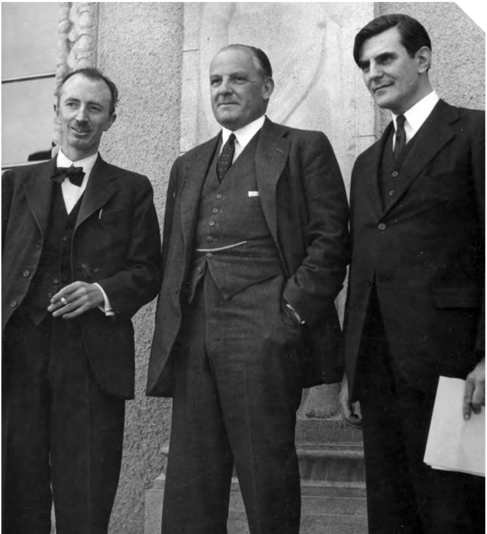
Three Directors together in 1938. Edward Phelan (left), then Director Harold Butler (centre) and John Gilbert Winant (right). They steered the ILO through the Great Depression and the Second World War.

Economic planning had led Albert Thomas in 1932 to further examine the relatively new concept of industrial relations. The United States had resorted to government involvement to counter the crisis. The Soviet Union and Italy practiced extensive planning. Thomas observed that if non-democratic societies paid attention to workers' interests, then traditionally more liberal societies ought to be able to do the same.