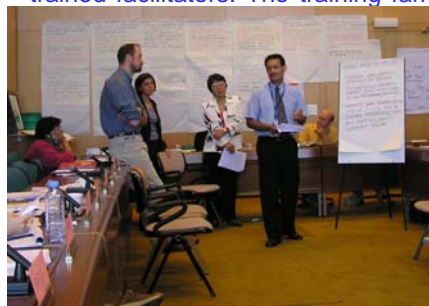
Participants at the gender audit facilitators training role-playing how to conduct a feedback session with an audited unit.

A four day training of participatory gender audit facilitators was carried out at the ILO from 17 to 20 May. Sixteen participants (eleven women and five men) from a broad range of ILO units were introduced to the methodology and approach of the gender audit and thereby joined the pool of trained facilitators. The training familiarised the participants