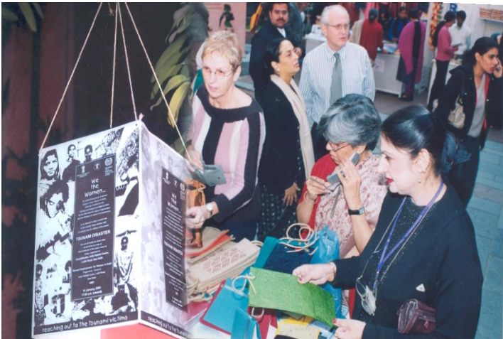
Customers at the trade fair organised by participants in the ILO pilot programme on 'Decent Employment for Women in India'. All the proceeds went to the National Relief Fund for Tsunami victims.

The pilot programme 'Decent Employment for Women in India' is being implemented in close cooperation with the Ministry of Labour and Employment and selected NGOs working with urban slum communities in Delhi and Bangalore. The programme has been making interventions over the last two and a half years on skills training and productive employment to improve the socio-economic position of poor women in urban slums. The target women are either unemployed or engaged in low paid work in the informal economy. Many of them are heads of households and forced to take up informal sector work out of need to survive.