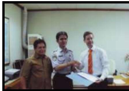
THE TRIPARTITE FORUM