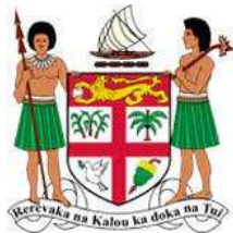
Ministry of Commerce, Trade, Tourism and Transport