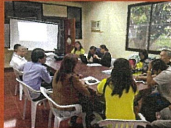
City Government and Its Agencies