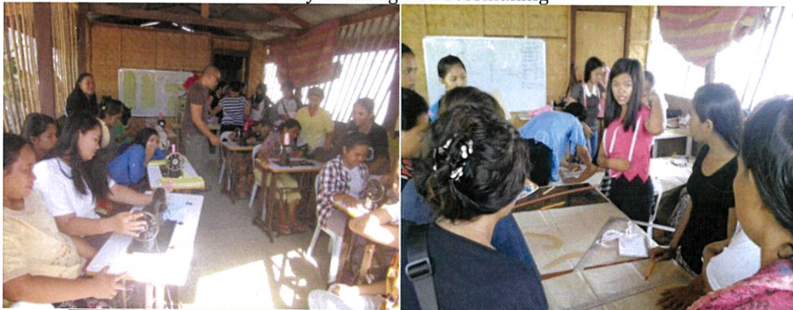
12-day Training on Dressmaking