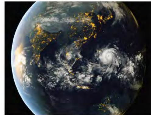
YOLANDA COMPREHENSIVE REHABILITATION AND RECOVERY PLAN