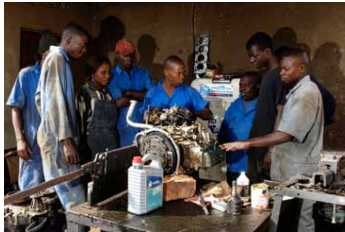
Former child soldiers who have benefited from the ILO's programme aiming at the reintegration of youth into civilian life. Bukavu, Democratic Republic of the Congo, 2008.

ILO's tripartite governing structure of government, employer, and worker representatives gives it a unique position among UN agencies. This tripartite structure makes the ILO a strong platform for governments and the social partners to debate and elaborate labour standards and policies. Drawing from this, a particular area of strength for ILO is its access on the ground to a broad spectrum of stakeholders. Its origins, mandate, and set-up give ILO access to the tripartite constituency in most countries—a significant advantage over other multilateral