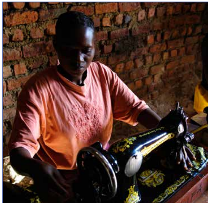
Former child soldier who has benefited from the ILO's IPEC programme which aims at the reintegration of youth into civilian life, Democratic Republic of the Congo.

Evaluations typically conclude that ILO projects have generally been relevant, they mostly achieve their objectives, are effective and often efficient (all things considered). Suggestions for improvement typically center on the flow of funds, administrative bottlenecks, better technical backstopping and on environmental constraints, which are beyond the control of the project. ILO is also often commended for its technical standards and for innovative approaches, such as community contracting nor integrating host community members into cooperatives with ex-combatants.