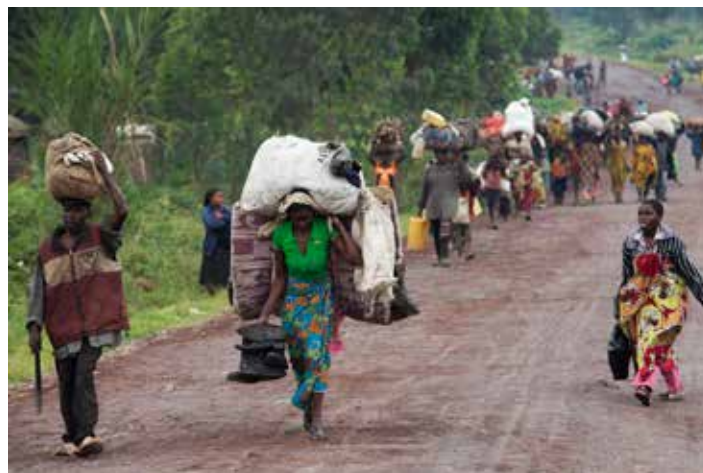
Residents of Rutshuru Territory flee their homes to seek safety in Goma, July 2012, Kibati, Democratic Republic of the Congo.

Overarching these considerations are the proposals coming out in the global dialogue on development. Several of the recently agreed post-2015 Sustainable Development Goals (SDGs) 7 touch directly on ILO's mandate. In particular, Goal 8 is to promote "inclusive and sustainable economic growth, full and productive employment and decent work for all". 8 Furthermore, the forthcoming revision of Recommendation 71 "Transition from War to Peace" in 2016 and 2017, places renewed