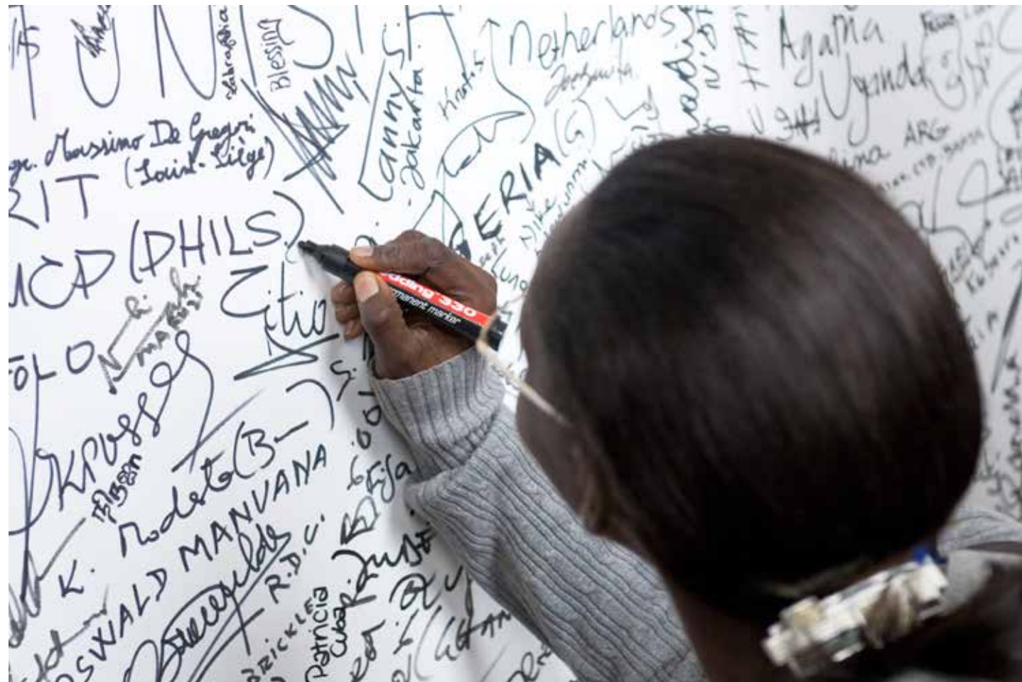
A young visitor to the Palais des Nations in Geneva adds her name to a symbolic signature panel in support of ILO's "50 for Freedom" campaign to end modern slavery. Geneva, Switzerland.