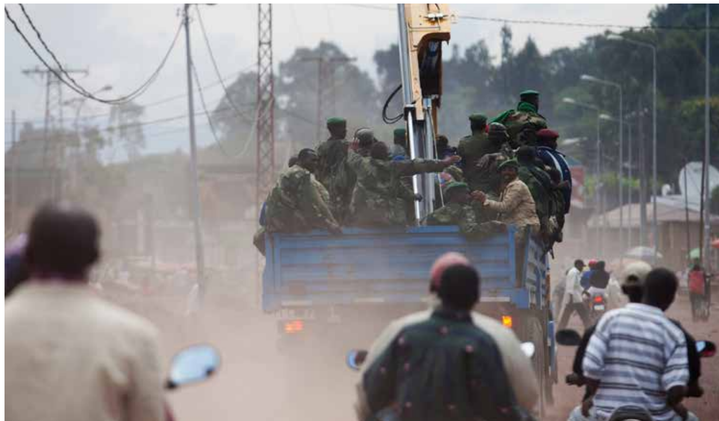
Members of the rebel group withdrawing from the North Kivu provincial capital of Goma in 2012. Democratic Republic of the Congo (DRC), represents one of the most complex cases of fragility in Africa.

Fragile states have several characteristics in common, such as widespread poverty, weak or dysfunctional governance, insecurity and an absence of productive opportunities. They also differ, however in important respects. Context specificity is therefore essential in designing a strategy for fragile states. The g7+ suggests, for instance, that countries in fragile situations may be placed in five different stages of progress depending on the drivers of fragility in each country.