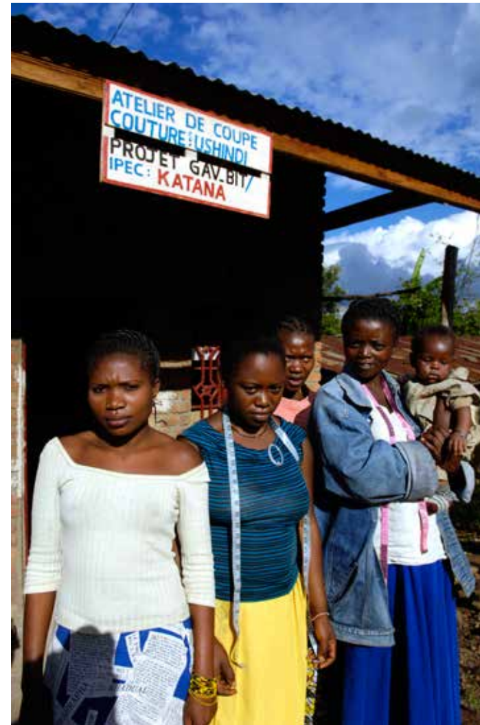
Former child soldiers who have benefited from the ILO's programme aiming at the reintegration of youth into civilian life. After their training as tailors, these young women run a workshop that functions as a cooperative, Democratic Republic of the Congo, 2008.

Unemployment is particularly high in fragile states, particularly of young women and men. Promoting employment and livelihoods requires a combination of short-run and long run approaches. The key will lie in facilitating a transition of graduates of skills development and vocational training programmes to sustainable self-employment or private sector demand.