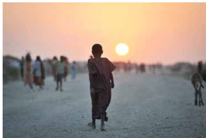
A Somali girl walks down a road at sunset in a camp for internally displaced persons (IDPs) near the town of Jowhar, Somalia, December 2013.