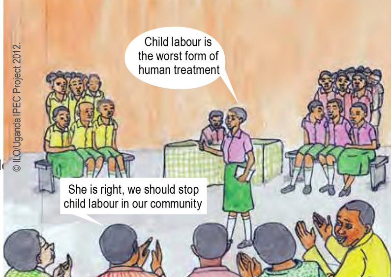
The SCREAM Module on HIV, AIDS and child labour was implemented by Kyambogo University through the "Child to Child" programme, in collaboration with Somero Uganda.