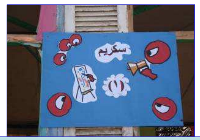
The collage workshop used activities from the SCREAM Education Pack to show children how much attention is given to child labour in the Egyptian press.