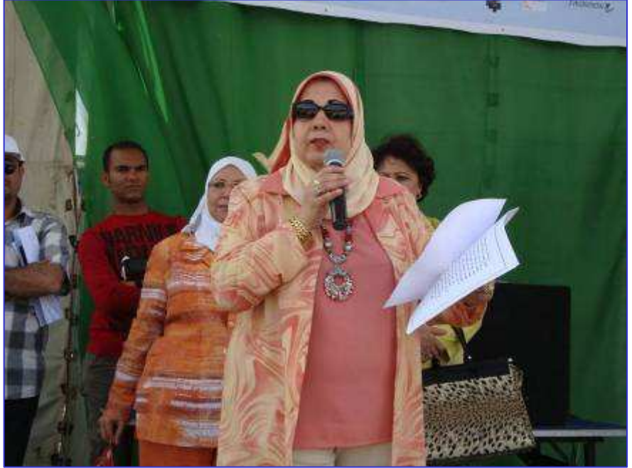
Representative of the Ministry of Social Solidarity.