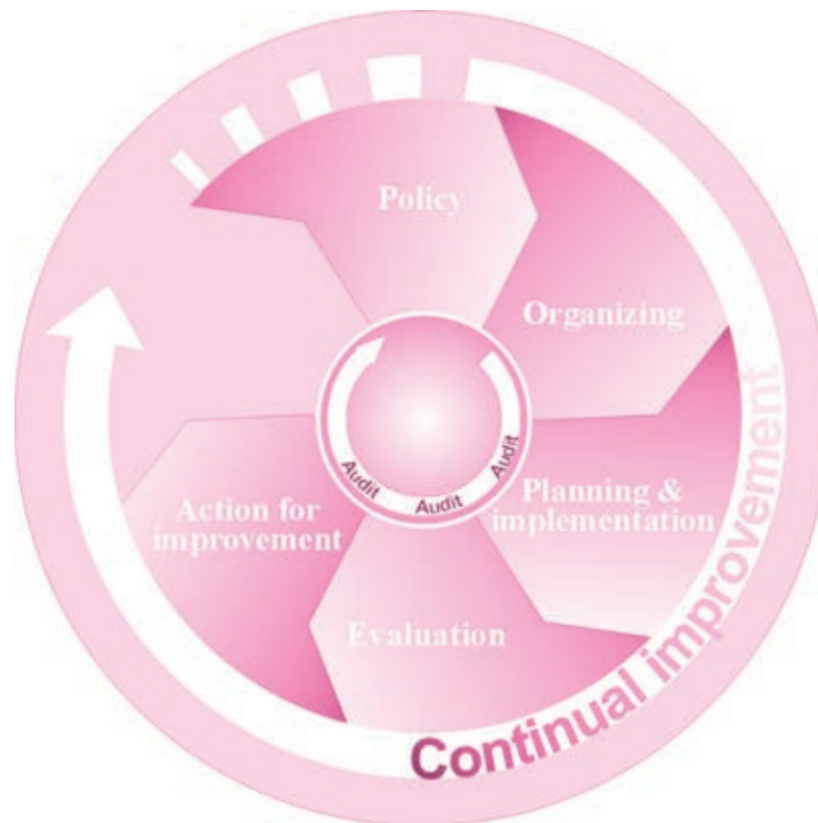
Figure 2. Main elements of the OSH management system

Occupational safety and health, including compliance with the OSH requirements pursuant to national laws and regulations, are the responsibility and duty of the employer. The employer should show strong leadership and commitment to OSH activities in the organization , and make appropriate arrangements for the establishment of an OSH management system. The system should contain the main elements of policy, organizing, planning and implementation, evaluation and action for improvement, as shown in figure 2.