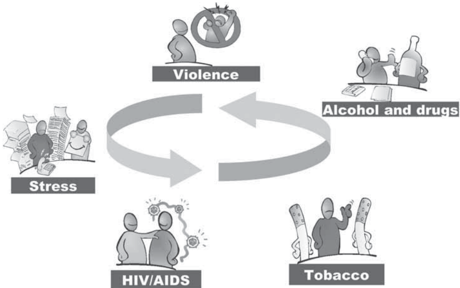
Figure 2. The interrelationships between psychosocial problems

This case, although fictitious, is close to reality. There is clear evidence that psychosocial problems are causal factors of other psychosocial problems. HIV/AIDS, stress, alcohol and violence are interrelated and they can reinforce each other in a most negative way. 4 As a result, in an enterprise or organization where there is much violence, there is a high risk that one or more additional psychosocial problems are either already rampant or will emerge as serious issues in the near future. Clearly, the impact of multiple psychosocial problems on worker health and enterprise survivability will be even more severe than violence