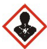
Target organ toxicity

The ILO initiated this project as a follow-up to the Chemicals Convention, 1990 (No. 170), and played an important role in steering its development and adoption as a UN technical standard, as well as ensuring the full participation of organizations of employers and workers. The GHS covers all chemicals, including pure substances and mixtures, except pharmaceutical products, and defines the chemical hazard communication requirements (labelling and data sheets) of the workplace, the transport of dangerous goods, consumers, and of the environment. It is thus a truly harmonized universal technical standard that will have a far-reaching impact on all national and international chemical safety regulations and technical standards. A large number of countries have made a commitment to a progressive implementation of the GHS.* Examples of the new GHS pictograms for a number of general hazard categories are presented below.