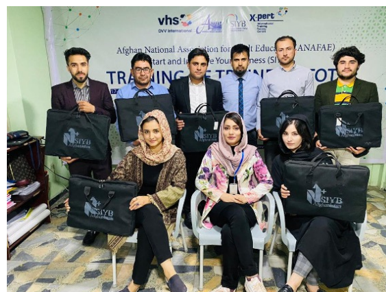
SIYB TOT OF SEDEP PROJECT RUN BY ANAFAE

In Afghanistan, one ToMT with 4 candidates was carried out by the Afghan National Association for Adult Education (ANAFAE), which is a SIYB partner organization. The potential master trainers of this ToMT trained 33 participants in 2 groups of ToTs. Also, 9 ToEs were carried out with 107 participants in 2021. All the trainings occurred on site.