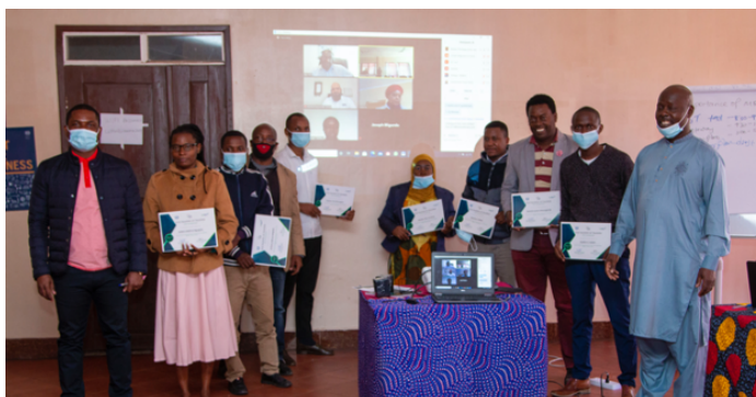
AFTER THE COMPLETION OF A TOT IN IRINGA, TANZANIA

Two ToTs were organized in Iringa, Tanzania with a total of 24 participants. These were offline trainings that involved aspiring BDS Providers, freelancer consultants and freelancers working with BDS organizations.