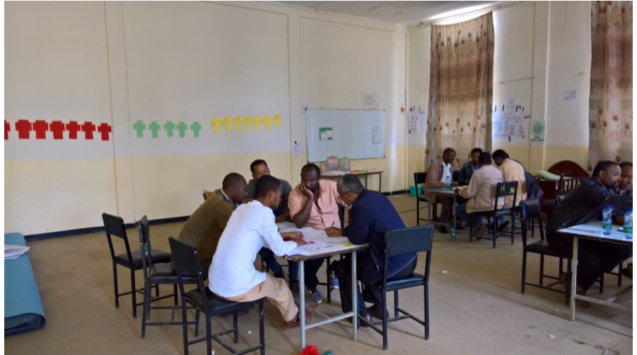
PLAYING THE SIYB BUSINESS GAME IN A TRAINING IN HOSANNA, SOUTHERN ETHIOPIA

In Ethiopia, 6 TVET institutions have conducted SIYB activities in 2021, including 8 ToEs for 250 potential entrepreneurs. Furthermore, nine trainers delivered GYB and SYB to 250 returnees under a project of the IOM (International Organization for Migration). An online follow-up survey of active trainers under the IOM project indicated that Covid-19 continues to affect training activities in Ethiopia.