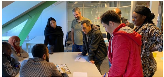
ENTREPRENEURS PLAYING THE SIYB BUSINESS GAME IN THE INCUBATION PROGRAMME AT PLAN EINSTEIN

In Utrecht, a new batch of the "Build Your Own Future Business" incubation programme started at Plan Einstein, using SIYB tools. In the programme, refugees and host community members participate in entrepreneurship training activities to learn and work together.