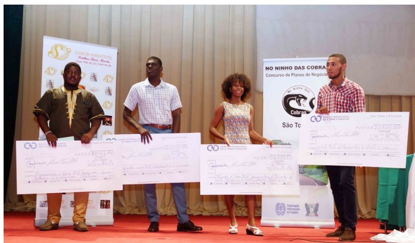
THE WINNERS OF THE BUSINESS PLAN COMPETITION "NO NINHO DAS COBRAS" IN SÃO TOMÉ AND PRÍNCIPE

Also, within the framework of the Joint ILO, UNDP and UNICEF Project “Economic Empowerment of Women”, 259 women from all Districts of the country including the Autonomous Region of Príncipe, have been trained in GYB and SYB in order to boost their business, very affected by the Covid-19 pandemic. This training was facilitated by the aforementioned refreshed trainers.