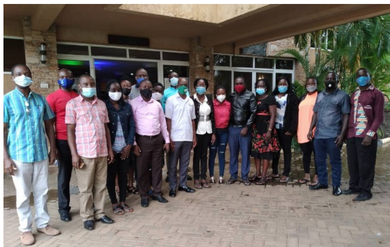
SIYB TRAINER CANDIDATES AFTER A 10-DAY TRAINING IN MBALE CITY, EASTERN UGANDA

Business Development Service Providers Network (BDSPN) was contracted by UNDP under the project Building Resilient Communities, Wetland Ecosystems and Catchment areas in Uganda. The objective of the project is to ensure that economically viable and sustainable livelihood and income generating interventions are introduced, promoted and supported in the wetland and immediate catchment. Under this arrangement, 30 SIYB trainers have been trained in two ToTs and will be certified to provide training to 800 beneficiaries. These beneficiaries will develop business plans after the training.