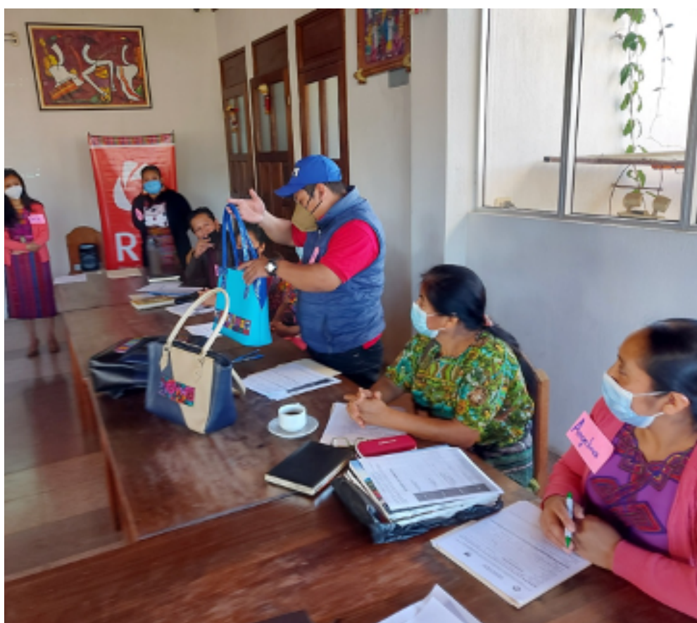
INDIGENOUS ARTISANS IN GUATEMALA

Through the ILO Office in Guatemala and the Support Programme for Decent Work for Indigenous People in Guatemala, 21 indigenous facilitators from the Maya Business School were trained. They belong to the REI Indigenous Entrepreneurs Network from the regions of: Totonicapan, Sacatepequez, Chimaltenango, El Quiche and Solola. IYB was implemented with about 100 indigenous entrepreneurs, having prepared 46 business plans, two of them membership organizations