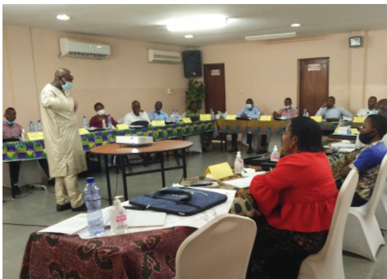
THE TRAINING OF 20 TRAINERS IN KINSHASA

As part of the ILO's technical assistance to the Youth Entrepreneurship in Agriculture and Agro-business Project (PEJAB), funded by the AfDB, 20 trainers (6 women and 14 men) from 8 incubation centers were trained in Kinshasa in the GYB and SYB packages of the SIYB Programme in May 2021. The PEJAB has two major objectives: The training of 6,000 young university-level farmers aged between 18 and 35 and the creation of at least 2,000 businesses by these young people.