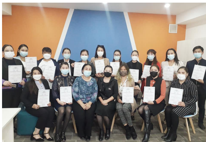
TOE IN PROVINCE UMNUGOBI (SOUTH GOBI), IN MONGOLIA

This year, 3 ToTs, 1 refresher ToT, 68 ToEs (of which 51 SYB, 17 IYB) were held in Mongolia. Due to the proliferation of Covid-19, most of the activities were conducted online, except for 15 TOEs, which were conducted in classrooms. As a result of these trainings, 11 SIYB trainers improved their classifications, 22 new SIYB trainers were certified, 238 entrepreneurs and 748 potential entrepreneurs were trained. Also, Bayankhongor Industrial Development Corporation became a partner organization. This corporation is organized as a business incubator and it trains entrepreneurs in the SIYB Programme.