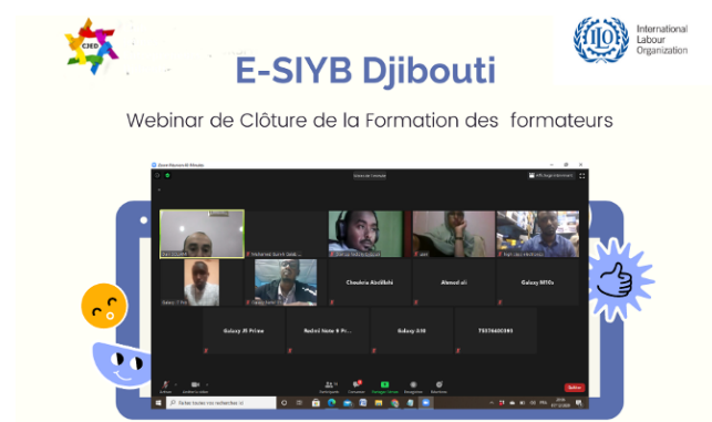
TRAINING OF TRAINERS USING E-SIYB TOOLS IN DJIBOUTI

The Club des Jeunes Entrepreneurs (CJED), a network of young entrepreneurs, had become the first SIYB partner organisation in Djibouti last year. This year a new SIYB ToT was held in the country. The 24 Trainers were trained using e-SIYB tools.