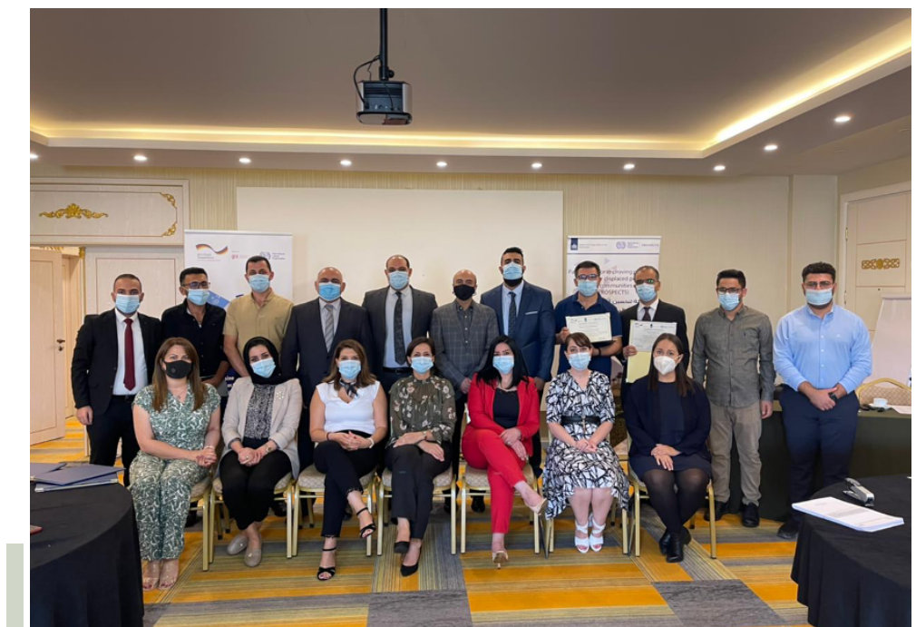
SIYB TOT CYCLE IN IRAQ

In the context of the PROSPECTS project, a full cycle of SIYB ToTs was conducted in Iraq. For that, the Arabic version of the material was revised. The project certified 13 new SIYB trainers.