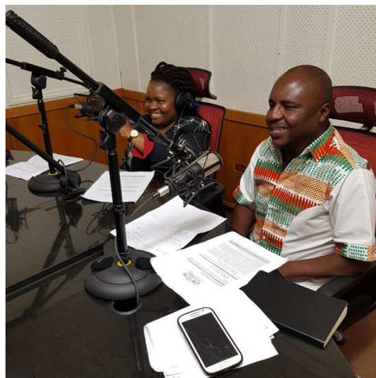
GYB TRAINING ON RADIO FOR POTENTIAL ENTREPRENEURS UNDER THE ILO GREEN ENTERPRIZE INNOVATION AND DEVELOPMENT IN ZIMBABWE PROJECT

As part of the training delivery adaptation to face the challenges posed by Covid-19 lockdown measures in Zimbabwe, Fine Touch Development Trust under the framework of the Green enterPRIZE Innovation and Development in Zimbabwe designed the GYB training programme to be delivered through 30-minute weekly radio sessions. The recordings can be accessed here . This adaptation enabled potential green entrepreneurs to establish if they were the right persons to start a business and to develop a feasible business idea. In addition to the 30-minute audio broadcasts, a selected group of participants had access to twice-a-week WhatsApp group discussions moderated by a trainer and completed exercises in the GYB workbook. Each participant received a soft copy of the GYB workbook to facilitate self-learning.