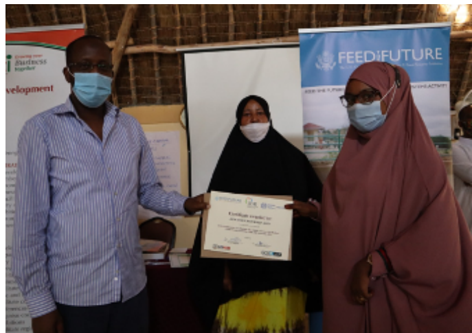
PARTICIPANTS UNDER THE ILO PROSPECT PROJECT GETTING THEIR CERTIFICATE

As part of the Better Utilization of Skills for Youth through Quality Apprenticeships (BUSY) ILO project, 4 ToTs workshops were conducted, training a total of 57 participants. As part of the Partnership for improving Prospects for host communities and forcibly displaced persons (PROSPECTS) project, 2 ToTs workshops were conducted, training a total of 25 participants.