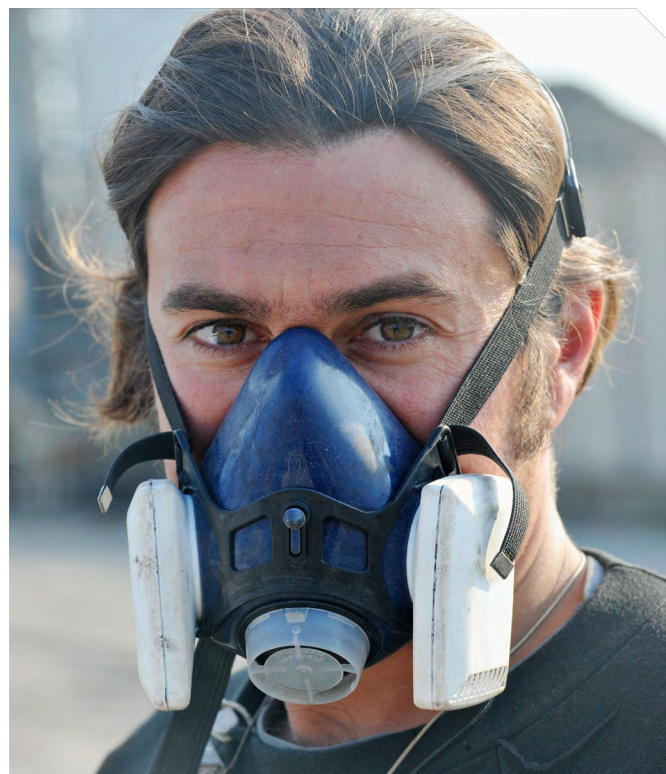
Portrait of a dockworker in the Port of Genoa.

In some cases, the sourcing and purchase of PPE and cleaning or health supplies may be affected by cost, overall shortages of equipment or the absence of an employment relationship. PPE and health supplies have been limited in some countries or for some categories of transport workers. For example, in June 2020, dockworkers at APM Terminals Callao in Peru reached an agreement with the company and the authorities for testing and additional payments after five dockers died and over 35 tested positive for the virus. 44