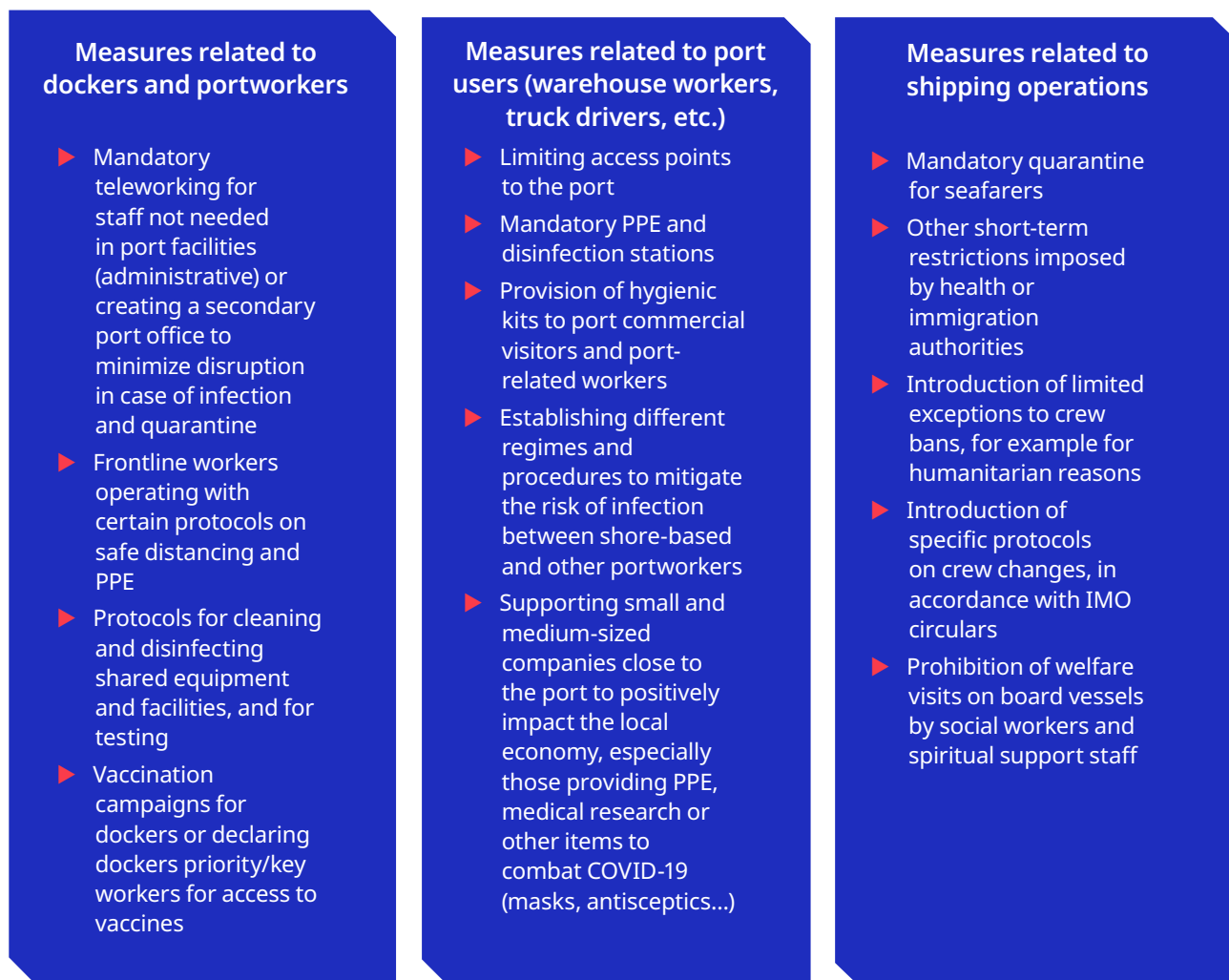
Figure 2: Operational measures to prevent the spread of and/or combat COVID-19 in ports: Three concomitant spheres of action