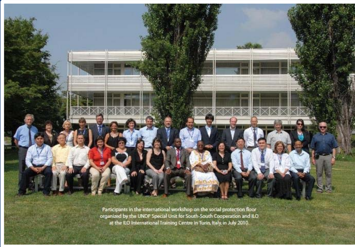
Participants in the international workshop on the social protection floor organized by the UNDP Special Unit for South-South Cooperation and ILO at the ILO International Training Centre in Turin, Italy, in July 2010.