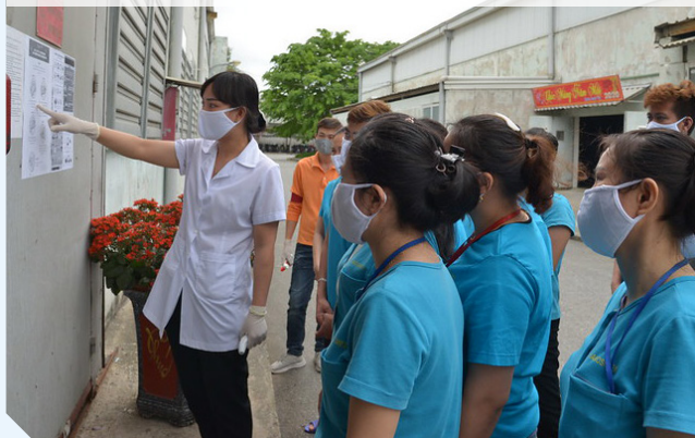
Workers in a Better Work partner factory are sensitized to OSH during the COVID-19 pandemic

As a partnership between the ILO and the International Finance Corporation, Better Work brings together