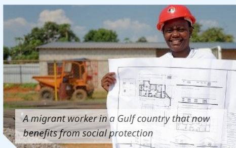
A migrant worker in a Gulf country that now benefits from social protection

The Flagship Programme supports the development of sustainable social protection systems, including floors, to contribute to universal social protection. Under the second phase of the programme, the ILO provides in-depth, in-country support to 50 countries to strengthen their social protection systems; encourage knowledge development and exchange on 16 specific areas of social protection; and engage in strategic partnerships with tripartite partners, the UN family and beyond.