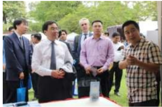
Siem Reap Provincial Career Fair, 10-11 September 2014.