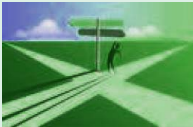
At the cross roads of undertaking research for Green Jobs

It is anticipated that research will be conducted on around 15 companies ranging from large scale multi-national; to small scale domestic enterprises. Adopting such an approach will enable the ILO to explore related issues, such as the business benefits of going green. For instance, findings from one of the initial case studies shows how a chemical company has developed a competitive edge through the implementation of a green business strategy. Other case studies are expected to show how companies can save money and become more efficient through the introduction of green practices. This piece of research is on-going and a draft report will be released later this year on the study's findings.