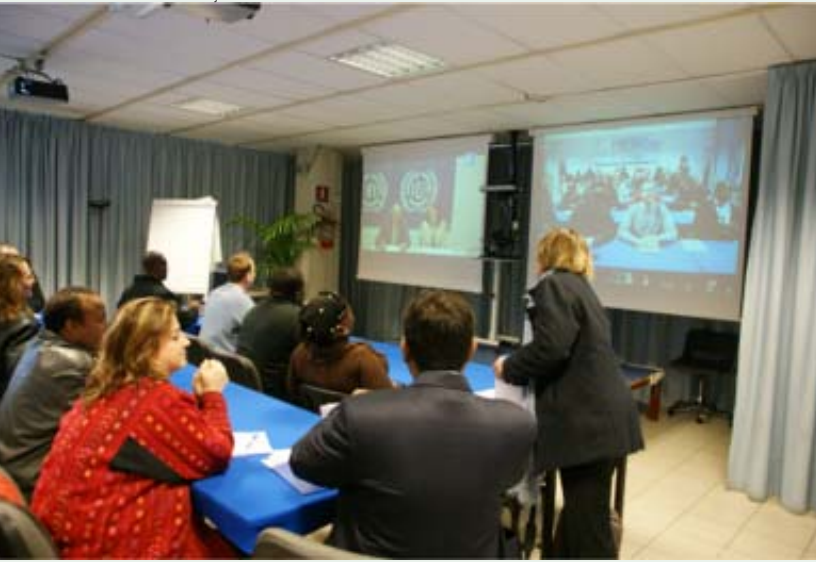
An illustration of a distance learning program using video conference facility as a delivery modality option for the programme course

environmental concerns and the recent move towards green jobs.