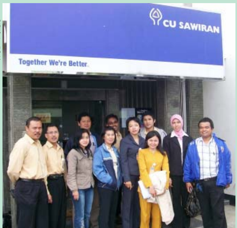
CU Sawiran team