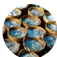
PHANG NGA/PHUKET/ RANONG/TRANG