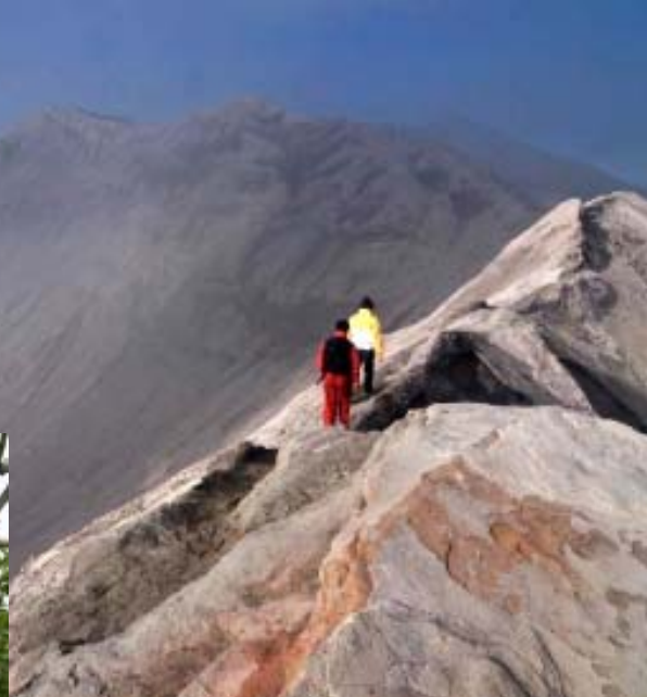
An amazing view: the caldera of Bromo

awareness among the local community and stakeholders about the importance of developing agrotourism. This includes promoting a better attitude towards environmental hygiene, encouraging hospitality and friendliness, and instilling discipline. The Agrofest will mainly consist of a fruit, vegetable, livestock and flower festival, complemented by supporting events such as a photo exhibition under the theme of agrotourism, pageant contest for flower girl and agrotourism ambassador, painting contest, fun bike, etc. All events will have a nuance of folk and traditional culture. Furthermore, there will be a Business Center at the festival ground, which is expected to be the embryo structure to better market agriculture products from the surrounding areas of Bromo, including Nongkojajar.