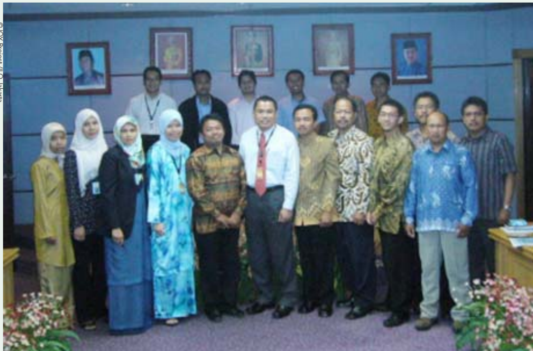
Study tour participants at the Vice Mayor office of Selangor

The first package tour was successfully launched in Poncokusumo by a group of 50 from Brunei and Singapore in December 2008. Also, an agro-festival will be held in Tukur in May-June 2009 to promote tourism in the area.