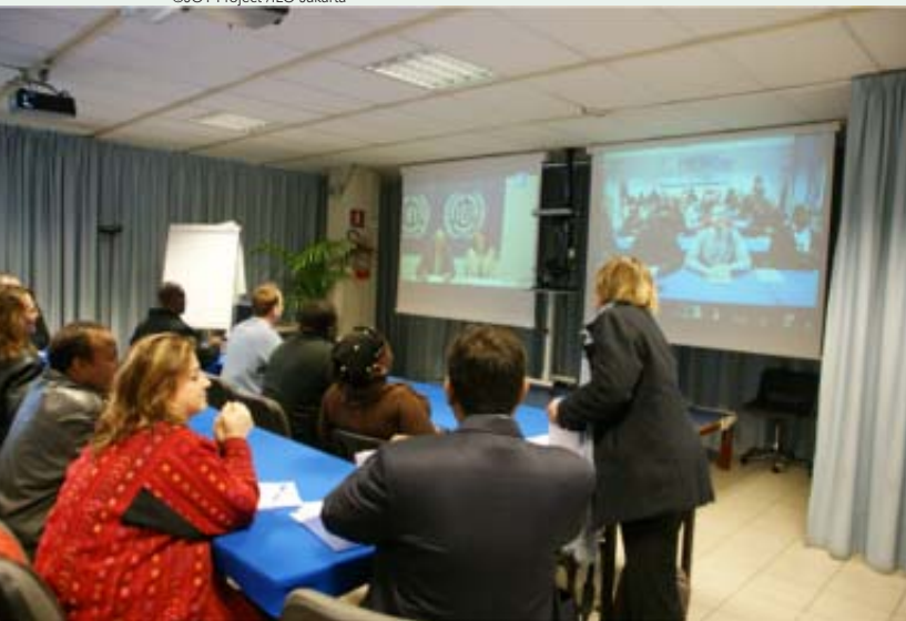
An illustration of a distance learning program using video conference facility as a delivery modality option for the programme course

environmental concerns and the recent move towards green jobs.