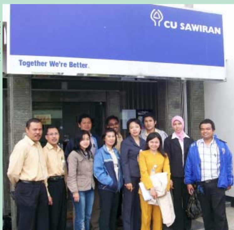
CU Sawiran team