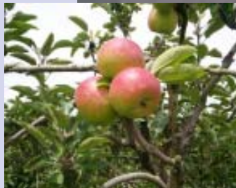
Apples: main product of Nongkojajar