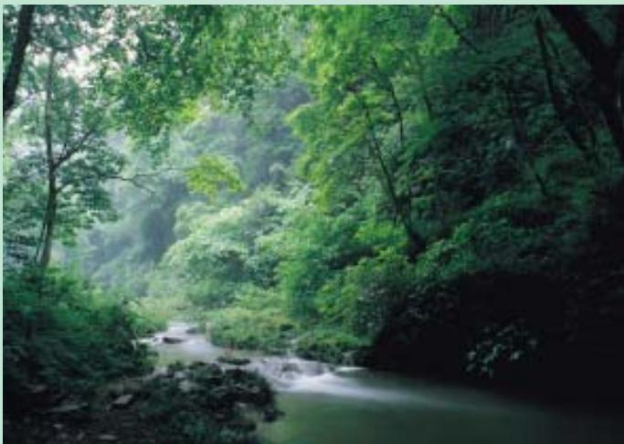
Around 2 million hectares of forest are cut down each year in Indonesia

The international community and the Government of Indonesia are aware of the need to reform forestry policy and to improve the ways in which the remaining forests are managed. It is against this background that the ILO Jakarta office is working with government and stakeholders to improve the livelihoods of those working in the forestry sector, especially to ensure that they perform their functions in a more environmentally friendly and sustainable manner. This involves JOY team collaborating with government counterparts and local communities to identify what skills and competencies labour inspectors in the forestry sector require to carry out their jobs in a more effective manner. Once the research has been completed it will help re-define how labour inspectors carry out their roles and ensure that companies working in this sector support decent and productive work for young women and men and have a more positive impact on the environment.