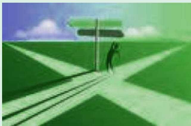
At the cross roads of undertaking research for Green Jobs

It is anticipated that research will be conducted on around 15 companies ranging from large scale multi-national; to small scale domestic enterprises. Adopting such an approach will enable the ILO to explore related issues, such as the business benefits of going green. For instance, findings from one of the initial case studies shows how a chemical company has developed a competitive edge through the implementation of a green business strategy. Other case studies are expected to show how companies can save money and become more efficient through the introduction of green practices. This piece of research is on-going and a draft report will be released later this year on the study's findings.