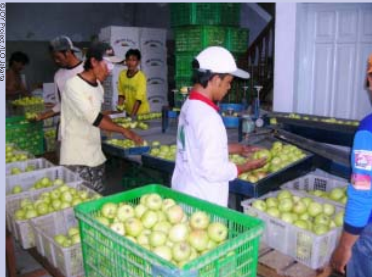
Apple grading in Poncokusumo

As part of LED activities, a forum was established – where representatives of the government, private sector and the local community can meet, exchange ideas and support each other's activities. Through the LED forum agriculture players, young farmers and other stakeholders can be involved in preserving biodiversity and supporting