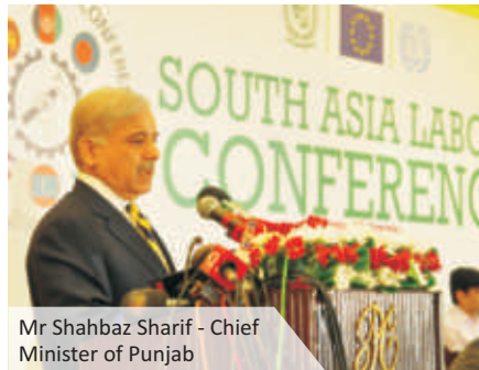
Mr Shahbaz Sharif - Chief Minister of Punjab