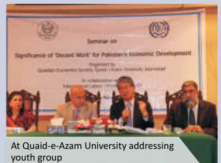
At Quaid-e-Azam University addressing youth group