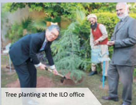
Tree planting at the ILO office