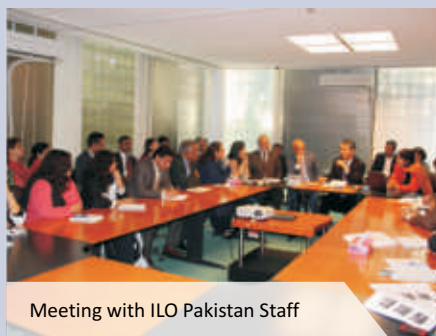
Meeting with ILO Pakistan Staff