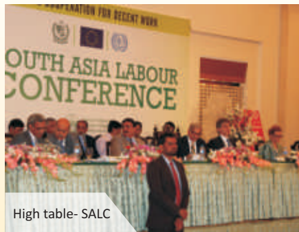
High table- SALC