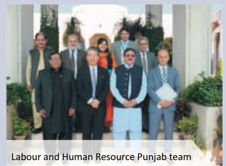
Labour and Human Resource Punjab team