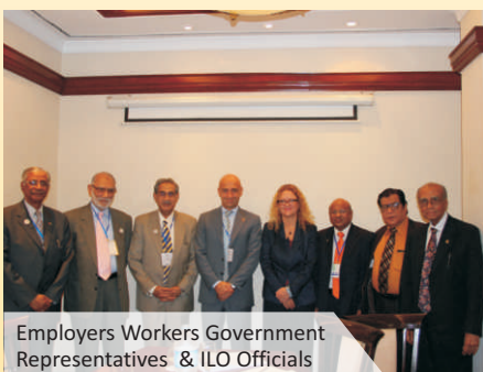
Employers Workers Government Representatives & ILO Officials