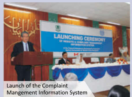
Launch of the Complaint Management Information System