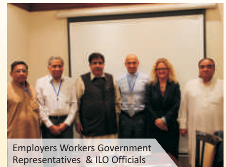
Employers Workers Government Representatives & ILO Officials