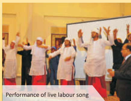
Performance of live labour song