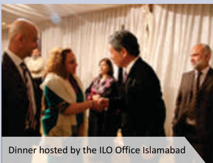
Dinner hosted by the ILO Office Islamabad