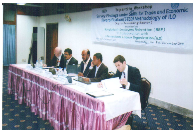
Workshop on the survey findings on agro-processing sector

On 7 December the participants and the stakeholders discussed various issues regarding the skill challenges and future skill needs for agro-processing industry. After discussions, the participants unanimously agreed that (i) enhanced capacity for improved regulatory compliance, (ii) safe food handling and cold chain management, (iii) sourcing high-quality agricultural inputs, (iv) quality inspection, and (v) international marketing were the most important priority areas where Bangladeshi agro-processing sector needed to improve capability and skills development.