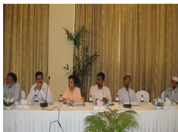
Snapshots from the meeting