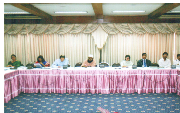
Participants during the sharing of the findings on agro-processing sector