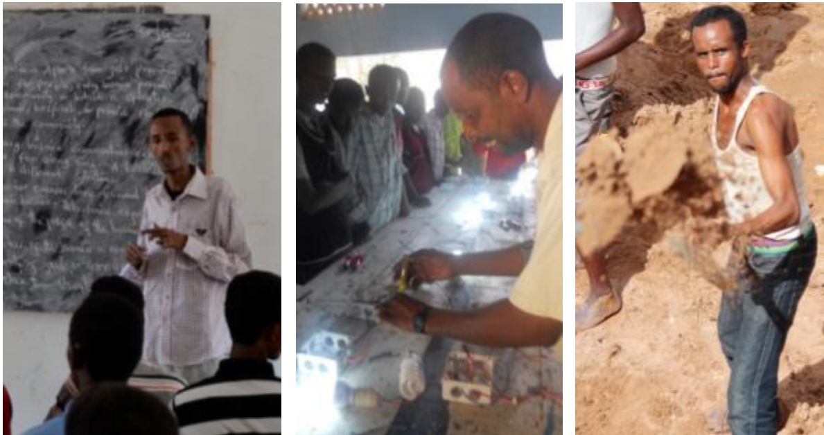
Left to Right: Phase1: Youth at-Risk Bossaso Business skills training Class; Bossaso Electrical Vocational Training; Youth Employment Intensive works, Burao