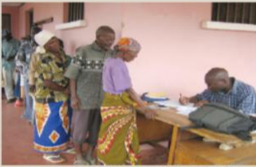
Registo manual aos beneficiários do PASD com o contacto

Entretanto, a Ministra do Género, Criança e Acção Social disse que o Governo e parceiros continuarão a investir na protecção social básica, pois, "é insustentável a sua contribuição no desenvolvimento do capital humano e na promoção da inclusão social", sobretudo de pessoas e grupos vivendo em situação de vulnerabilidade.