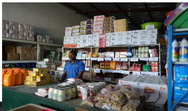
in local retailer (left), local retailer (right) in Sofala.

In order to bridge the gap between first line humanitarian in-kind assistance and the activation of the government post-emergency cash grant in the central region of Mozambique, WFP and UNICEF implemented jointly a multipurpose voucher programme. This is an example of an intervention working in the nexus between humanitarian and development assistances. By the end of November 2019, the JVP completed its third and last distribution of multipurpose vouchers in Sofala province. An average of 22,167 households (10,249 in Dondo district and 11,918 in Nhamatanda district) were reached in three distributions. The families were able to use the vouchers with a monthly value of about $43 (2,670 MT) to purchase food and essential hygiene and household non-food items (NFI). C4D activities complemented voucher distributions with key messages on hygiene and nutrition.