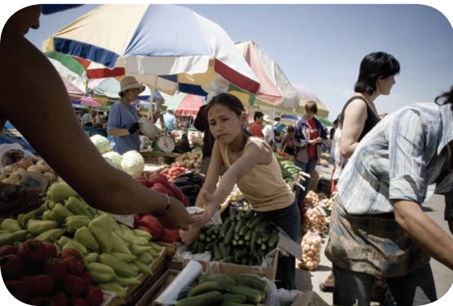
A girl at at the market, Almaty city, 2006.