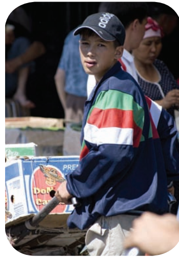
A boy-loader at the market, Almaty city, 2006.