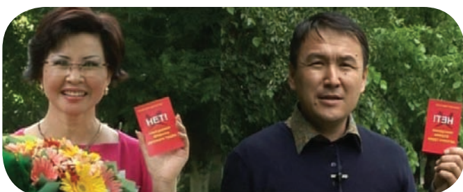
Roza Rymbayeva and Ramazan Stangazyev, national artists of Kazakhstan.

In 2009, in honor of the 90th anniversary of the first Child Labour Convention, the 10th anniversary of the Child Labour Convention No. 182 and the 90th anniversary of the International Labour Organisation, WDACL activities gave special attention to girls involved in child labour. The WDACL campaign included a collection of signatures to support the WDACL campaign in Almaty, a quiz on child labour and a concert organized by children's creative groups in the Family Park, in Almaty.