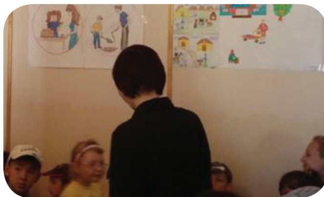
Drawing contest – June 12, World Day Against Child Labour, 2006.

Since 2006, IPEC Kazakhstan has trained over 30 journalists on the issue of child labour issue. These journalists have continued to raise awareness and as a result of the issue of child labour is widely covered by the media on a regular basis in Kazakhstan. Over 300 articles have been written in daily newspapers, of which 35 were in Kazakh language. Media coverage has also included broadcasting over 30 programmes on TV and radio channels.