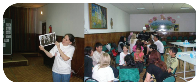
Sessions with children using SCREAM modules, Almaty, 2009.

In 2009, the programme "Enhancing the capacity of partners in the Republic of Kazakhstan in combating the WFCL through SCREAM" was implemented in Kazakhstan. Its main objective was to contribute to the elimination of child labour in Kazakhstan by increasing the capacity of partners and key stakeholders in combating WFCL by using SCREAM modules. Potential SCREAM trainers were selected among the students of six colleges in Almaty and senior school students of secondary schools (9-10 grades). Master-classes were attended by 180 students, out of which over 80 young people were selected as SCREAM trainers for summer-camps. Sessions for children using SCREAM modules took place in seven summer camps for 1,815 children from 6 to 17 years of age.