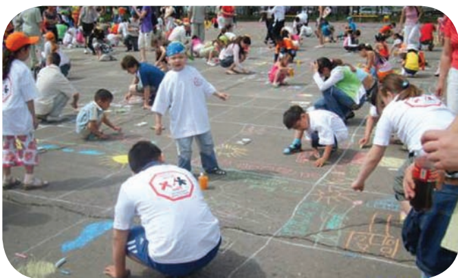
Press conference, drawing competition on the pavement June 12, World Day against Child Labour, 2008.

In 2008, WDACL press conferences were organized in all 16 regions of the country within a nationwide awareness raising campaign on "Education is the right response to CL" presenting the results of mass media competition on the best publication on "WFCL: life stories".