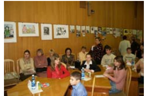
Participants in contest Stop Child Labour!

Social policy experts will conduct a poll of the two countries' representatives of government, non-governmental organizations,