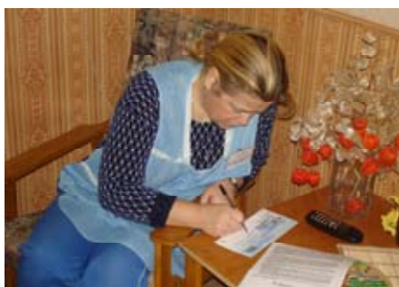
Worker of a pilot enterprise in Serpoukhov writes 'a letter of promise' to fight HIV/AIDS