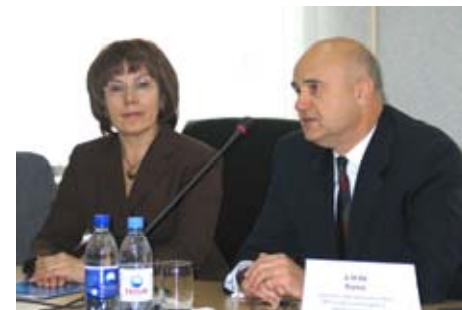
Labour Minister of Kazakhstan, G. Karagusova (left), W. Blenk

The document emphasises that the main goal of Kazakhstan's economic and social policy in 2007-2009 will be "the creation of favourable institutional and economic conditions to ensure that