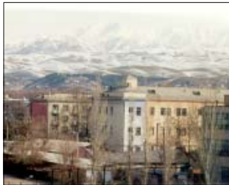
View from a hotel room