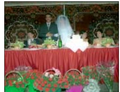
Tajik wedding reception