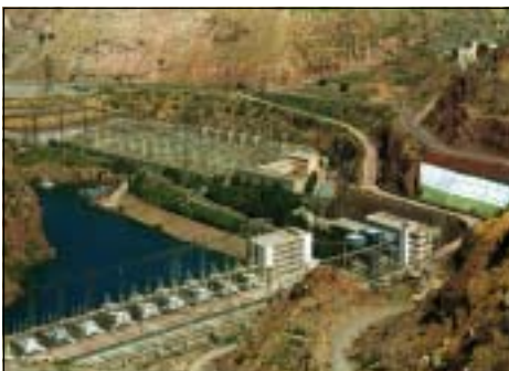
Nurekskaya hydro electric power station