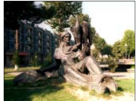
Monument to Omar Hayam in Dushanbe