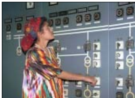
Engineer at Nurekskaya power station