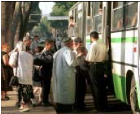
Streets of Dushanbe