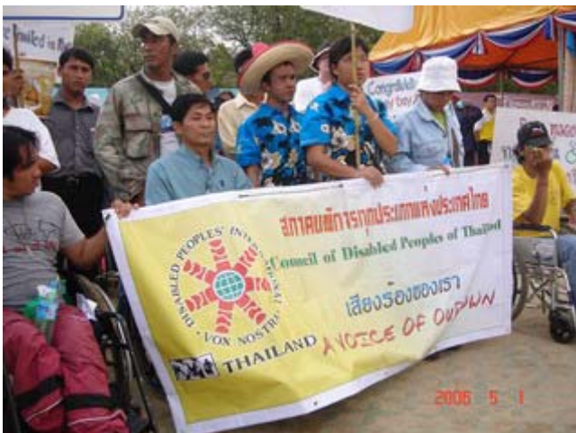
The Council of Disabled People of Thailand (DPI-Thailand) actively joined Labour Day 2006 Campaign.