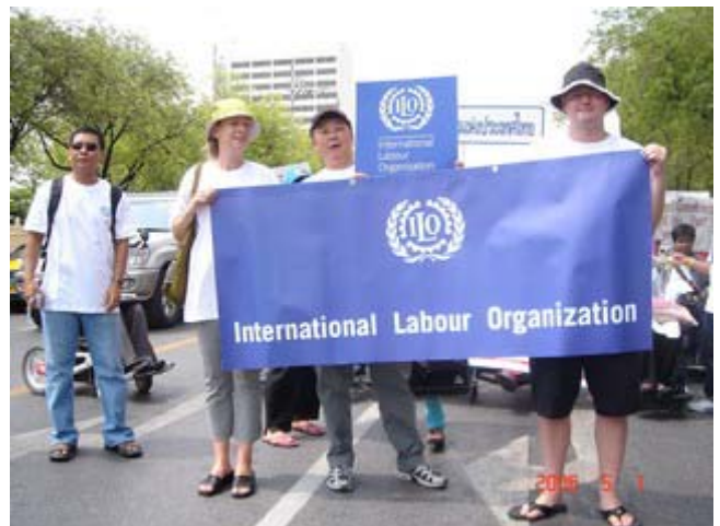
Staffs of ILO Sub-regional Office for South East Asia, based in Bangkok, also joined to promote Decent Work and ILO Convention 159.