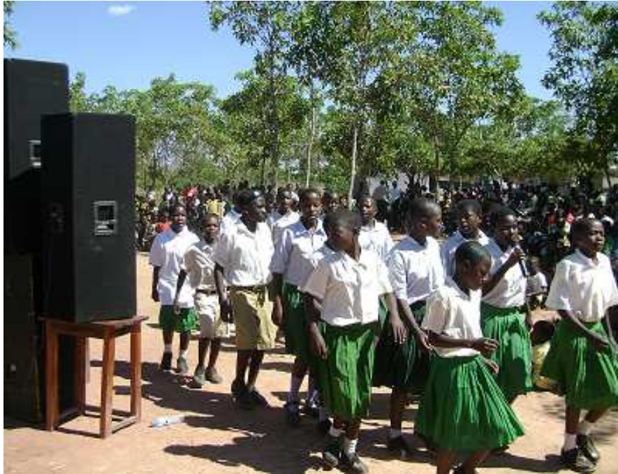
Kalemela 'A' Primary School Students singing anti child labour song