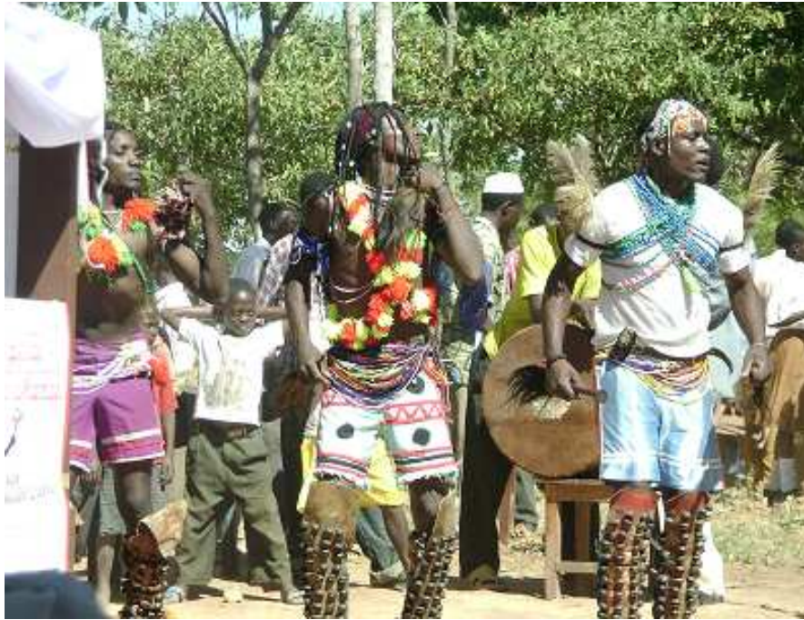
Cultural Group performing in Muungano Ward on June 12 th 2009

Project beneficiaries – School children, parents, representatives from the Ministry of Labour, Employment, and Youth Development; Ministry of Community Development, Gender and Children; and senior officials from Urambo District. Others include, representatives from Tanzania Plantation and Agricultural Workers Union/Trade Union Congress of Tanzania (TUCTA); Association of Tanzania Employers; Association of Tanzania Tobacco Traders; Western Zone Tobacco Cooperative Union; ILO/IPEC-UTSP Implementing Agencies and the public.