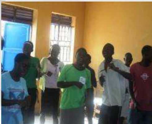
The rehearsals at KIN mengo Kisenyi

The day this year was held at Kyambogo University and it was preceded by a series of events. Amongst the events was an art competition, educational talks and music dance and drama trainings . The M.D.D trainings were done in preparation for the launch of the national child labor song. The SCREAM clubs of KIN and UYDEL were brought on board for this.