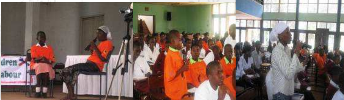
The power of a microphone! Participants share ideas during the discussions