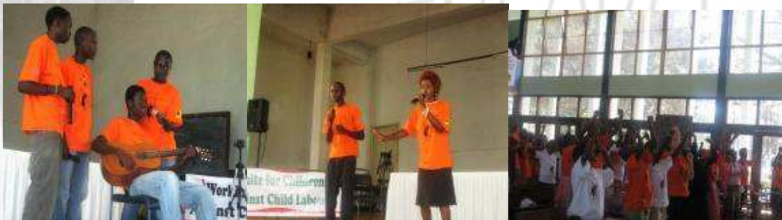
Well, as the common saying goes; work without play.....participants enjoy a music interlude.