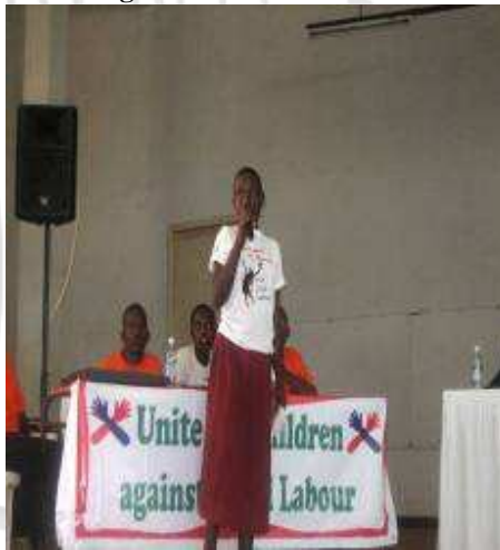
A child reads out the declaration while another child on the right welcomes the chief guest to address the gathering.