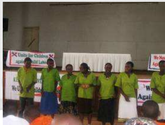
The launching performance of the song on 12 th June