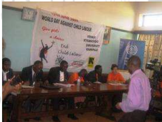
Ready for the press conference. Children representatives get ready for the press conference while on the right, the panel selected to respond to the children's concerns in the press conference.

Appreciation goes to all partners who made this possible. It's very obvious that more still needs to be done and therefore a combined effort is needed. The children this year exhibited their capabilities and at the end of the day we all realized that children should