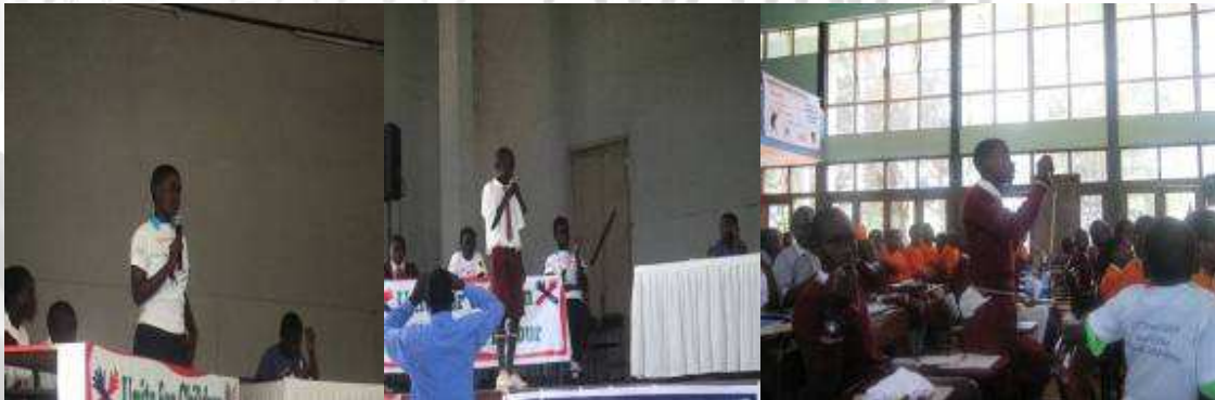
And then the cross fire, the great debaters try to convince the house that their arguments are better.

Then came the big day! This was characterized by enormous child participation. With such colorful presentations, there was no chance for boredom. The children spear-headed the ceremony straight from the MC, to the reading of the declaration and chairing of the press conference. All this was meant to highlight the significance of the role of young people in the fight against child labor