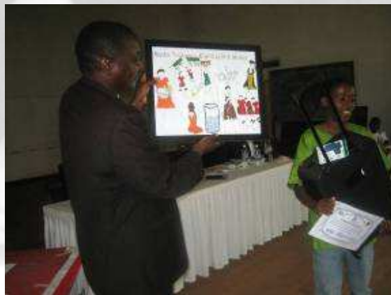
The chief guest shows off an art piece while artist Looks on.

The educational talks involve activities such as discussions, debates and quizzes. All these were centered on the theme “give girls a chance end child labor.” All the activities encouraged a participatory approach and whoever desired to share his or her views was given a chance to do so.