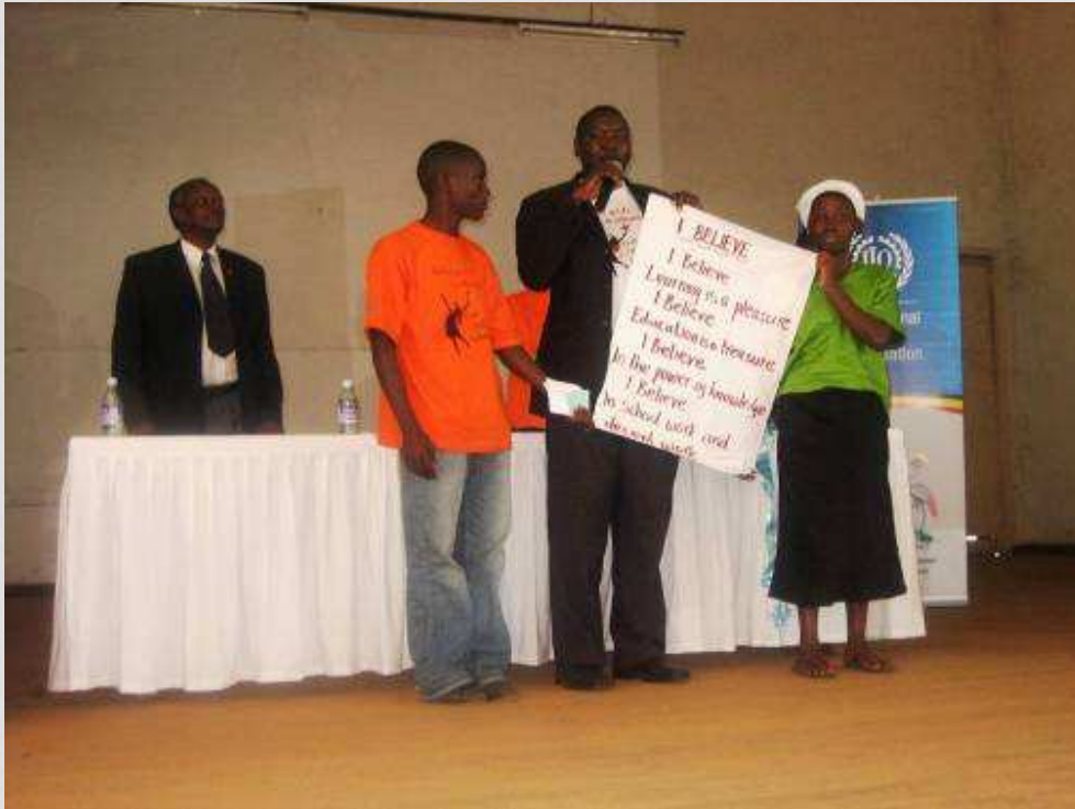
The chief guest is joined by children to launch the national child labor song

The art competition attracted art pieces from all over the country but like in other competitions only five children could walk away with the awards. The awards were provided curtesy of the International Rescue Committee. The winning pieces were selected in respect of a set criteria developed by the panel of judges.