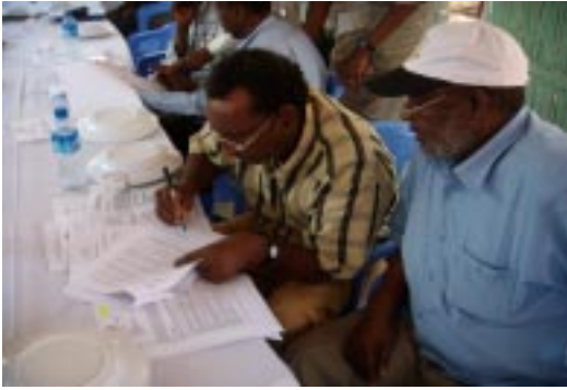
Burhakaba DC signing agreement

A rapid assessment survey of potential infrastructure employment focused projects in all five districts has been completed. Using the assessment the local engineers and other technical staff are working with the District Commissioners and Public Works Departments in the five districts on project selection criteria. Projects will ideally target the most vulnerable and have high employment content. Potential projects include solid waste management, feeder road spot improvement, drainage improvement and water catchment rehabilitation. It is the responsibility of the District Public Works Committees in consultation with their constituents to prioritize projects. The District Engineers, employed by the respective Public Works Departments will subsequently draw up budgets and bills of quantities to be approved by ILO before project implementation begins. Workers will be hired by the council using agreed procedures and practices.