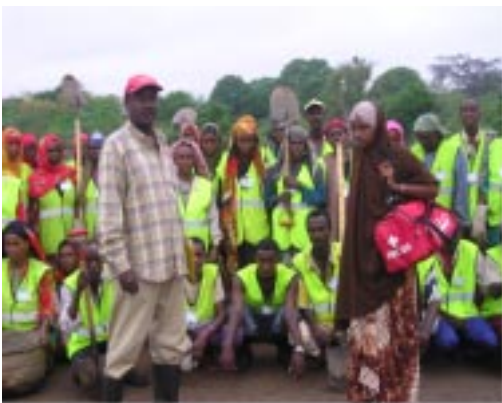
Workers in Baidoa

Meanwhile the community employment project in Baidoa, which employed 205 people from August 2006 ended at the end of November.. On completion of this successful project which involved the Baidoa District Commissioner upon his appointment, ILO continued to work with the Council providing some modest resources to continue to carry out minor works. This allowed the project to establish a solid working relationship, assess the attitudes and capacities, and contributed to the design of longer term agreements with all five districts.