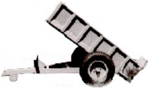
3 meter cubed Tipping Trailer

Finding adequate trailers for labour-based road construction programmes has always been a problem. In Kenya, the Minor Roads Programme has over the years developed two trailers (one tipping and the other non-tipping) that seem to be ideal for this sort of work.