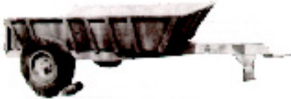
3 meter cubed Non-Tipping Trailer