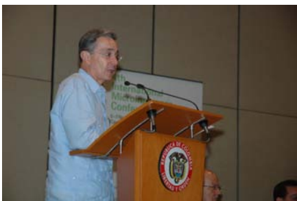
President Dr Uribe at the podium

Munich Re Foundation, Fasesolda and the Fides recently organised the Annual Microinsurance Conference . Held in Cartagena, Colombia, the event was opened by the Colombian President Dr Álvaro Uribe, who declared: "In Colombia, microinsurance has the potential to reach even the poorest of the poor. Education about insurance and raising awareness of coping mechanisms is crucial. People must understand that insurance is the first option for dealing with emergencies — be it a personal shock like health problems, financial crisis, or natural disaster. Instead of going to a money lender or the financial black market they should think of insurance first."