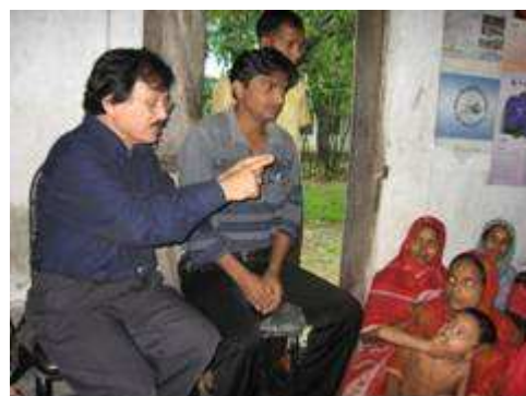
RADOL's team in the field

Through a technical assistance grant, RADOL plans to strengthen a consortium to pilot microinsurance and validate its product offering.