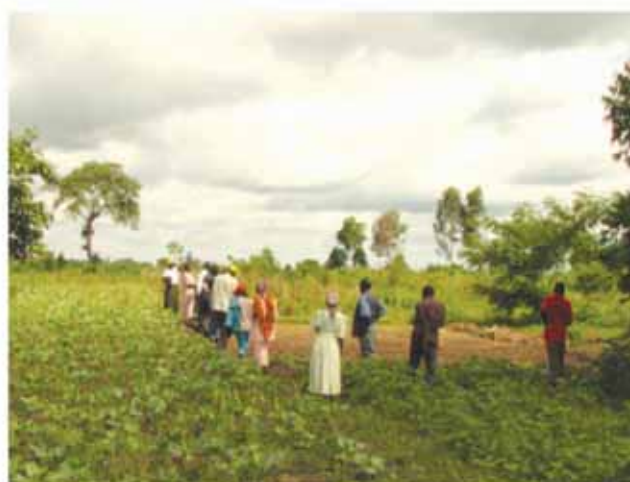
Project site: Bungoma, Kenya