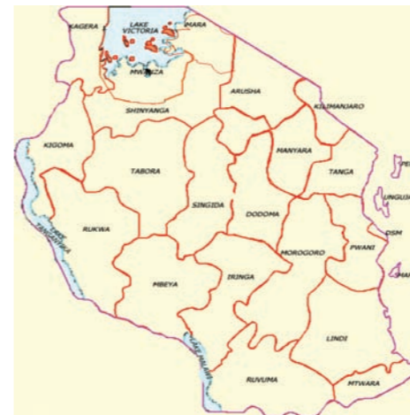
National Bureau of Statistics Tanzania