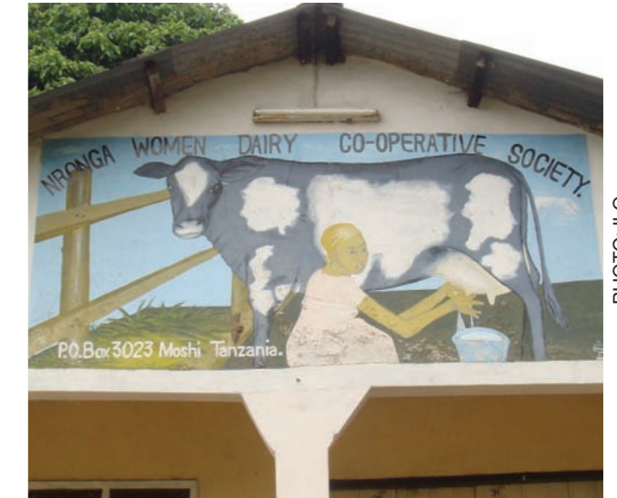
Nronga women Dairy Cooperative society in Kilimanjaro Region.

Tanzania Commission for AIDS (TACAIDS), the Prime Minister’s Office Regional Administration and Local Government (PMO-RALG), the Ministry of Labour, Employment and Youth Development, the Association of Tanzanian Employers (ATE), and the Trade Union Congress of Tanzania (TUCTA).