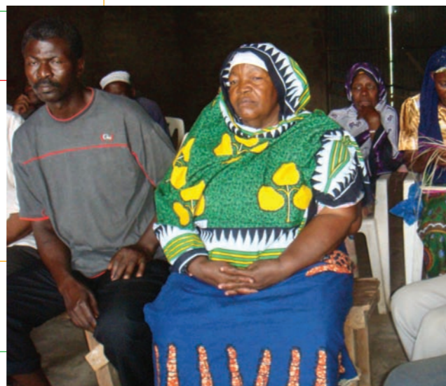
Members of Mwendapole Agriculture Cooperative Society in Kibaha,Coast Region