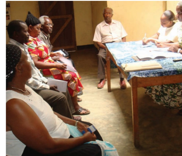
Board members of Nronga Women Dairy Cooperative Society

Project Budget: USD 450,000, including regional component.